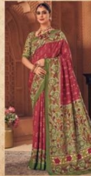
90711 (Exclusive full)