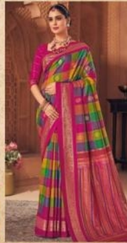
90707 (Exclusive full)