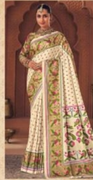
90708 (Exclusive full)