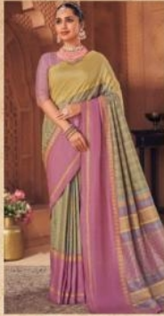
90703 (Exclusive full)