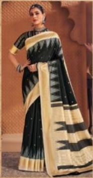
90705 (Exclusive full)