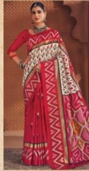
90704 (Exclusive full)