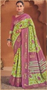
90702 (Exclusive full)