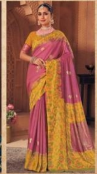
90713 (Exclusive full)