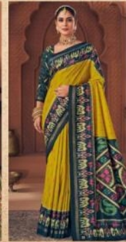
90712 (Exclusive full)