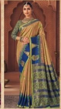
90710 (Exclusive full)