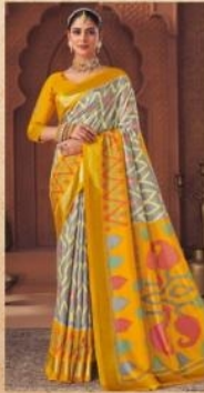
90706 (Exclusive full)