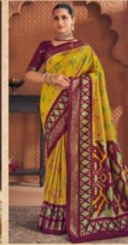
90709 (Exclusive full)