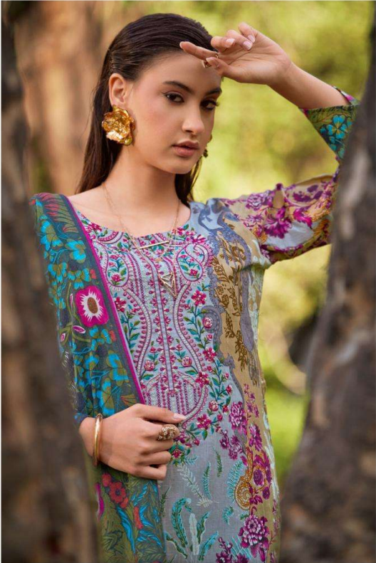
877-004 "I think there is beauty in everything. What 'normal' people perceive as ugly, I can usually see something of beauty in it."