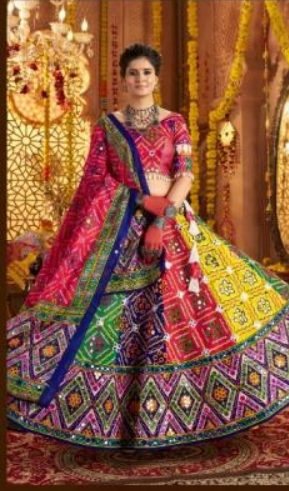
RASS - 11033