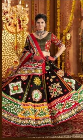
RASS - 11032