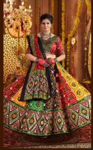
RASS - 11034