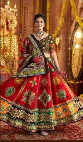
RASS - 11031