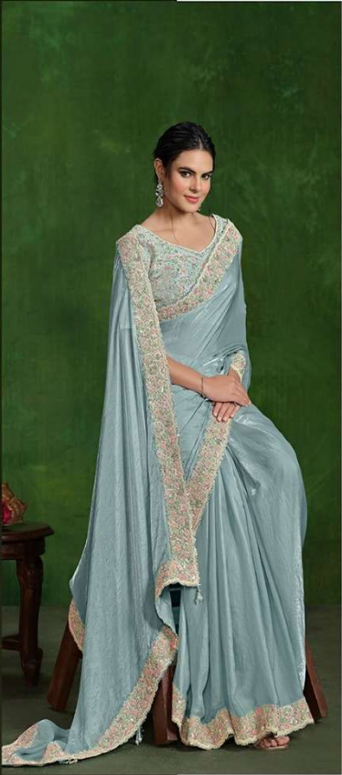
24304 FABRIC : TWO-TONE SIMMER SATIN BLOUSE : EMBROIDERED READY TO WEAR