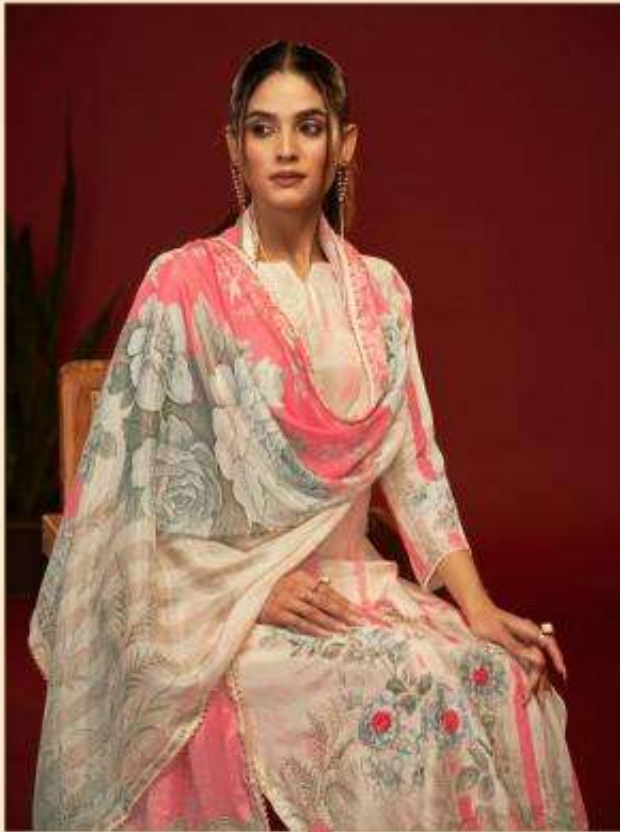
DIVYA KURTA WITH PINK AND GREEN FLORAL EMBROIDERY DUPATTA WITH PINK AND GREEN FLORAL PRINT PANTS WITH PINK AND GREEN FLORAL EMBROIDERY