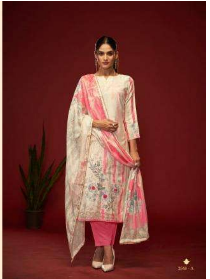
2568 - A