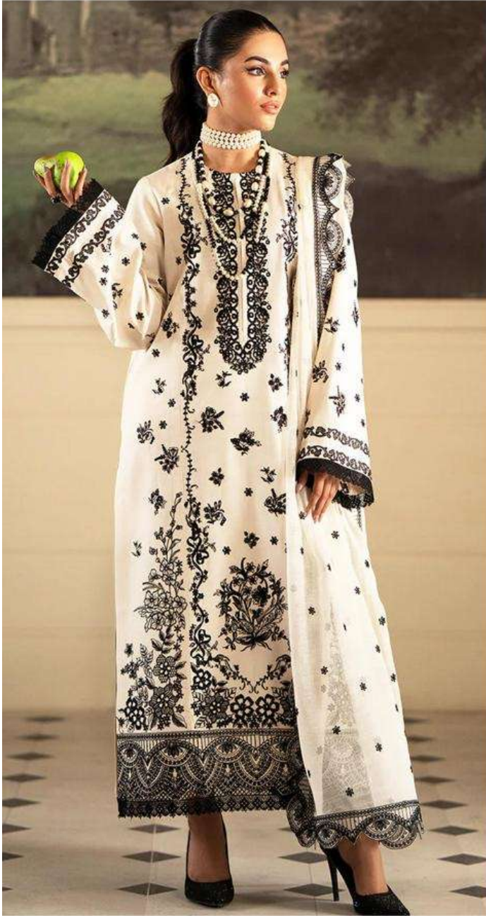
JT D.NO.158 A