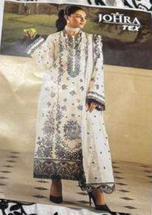
JT D.NO. 158 A TOP:- REYON COTTON HEAVY EMBROIDERED WITH PEARLS MOTI WORK DUPYTA:- JOHA CHECKS HEAVY EMBROIDERED BOTTOM:- REYON COTTON