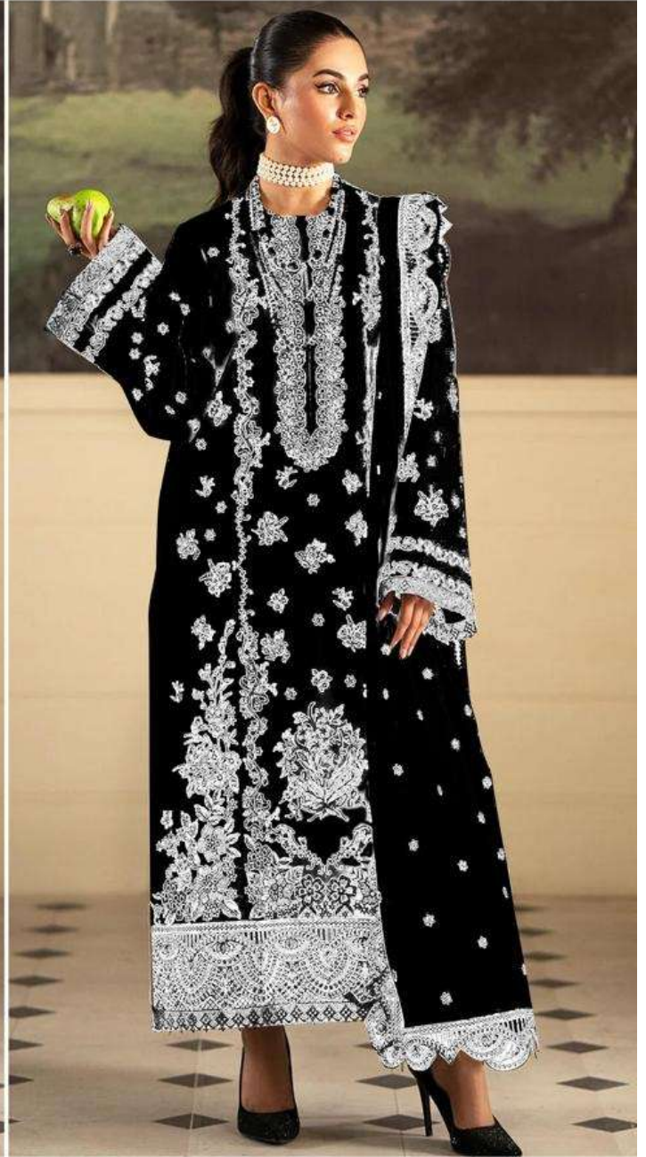
JT D.NO.158 B

TOP :-REYON COTTON HEAVY EMBROIDERED WITH PERALS MOTI WORK DUPATTA :-KOTA CHECKS HEAVY EMBROIDERED BOTTOM:-REYON COTTON