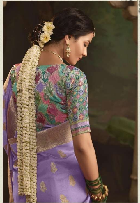
SA-368 | "Saree: The fabric of tradition and grace."