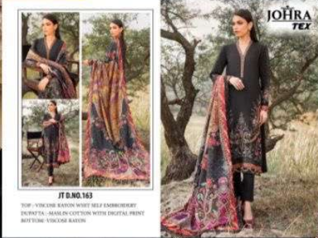
JT D.NO.163 TOP - VISCOSE RAYON WITH SELF EMBROIDERY SKIRT - MADE IN COTTON WITH DIGITAL PRINT SHAWL - VISCOSE RAYON