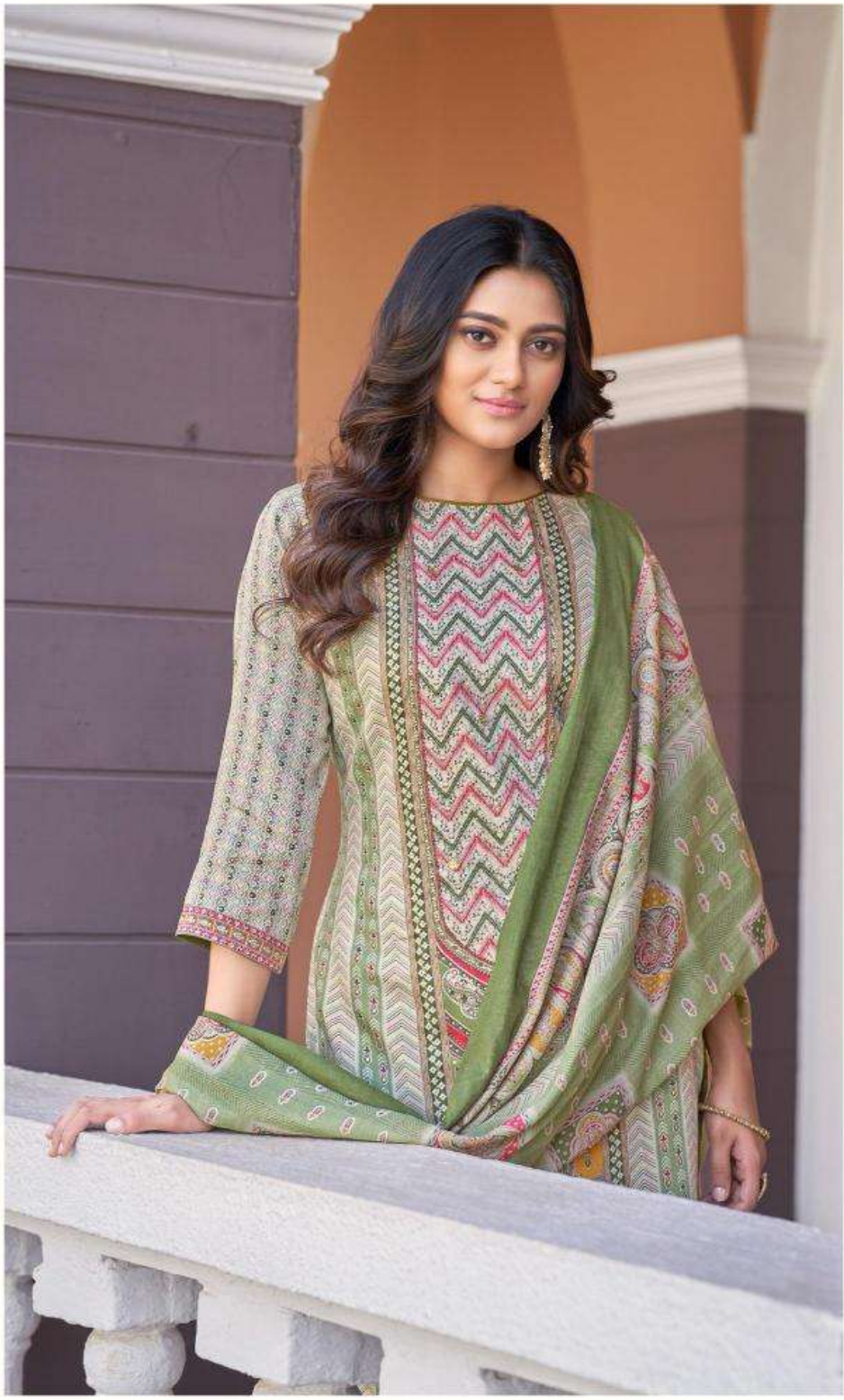
yes, elegance and style is always an integrated part of village attire. and when you adopt such style, you feel a sense of elegance and spirit of look.