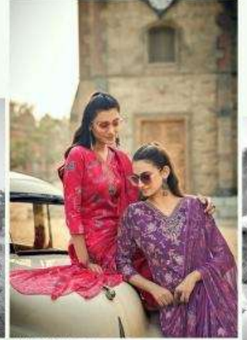
YOUR BEST DRESS IS THAT WHICH TO MAKE YOU A WOMAN WHO LEADS BY YOUR FEELINGS FOR HER DAY.