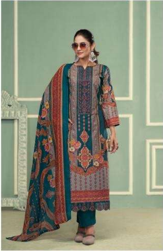
THE SHINING STAR

Radhika, The Shining Star, is a registered trademark of Radhika. All rights reserved.