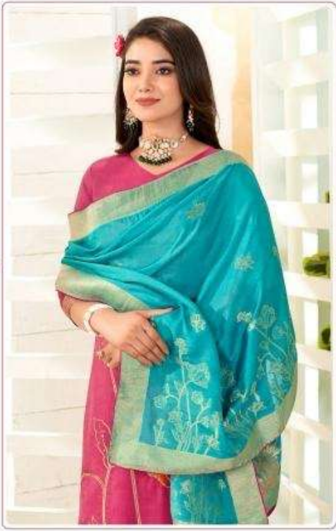
Embrace yourself with a glamorous look with this amazing ethnic collection.