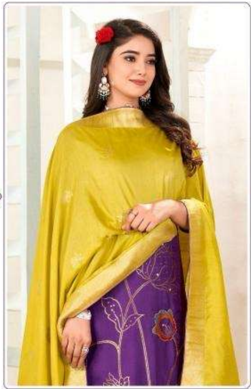
Embrace yourself with a glamorous look with this amazing ethnic collection.