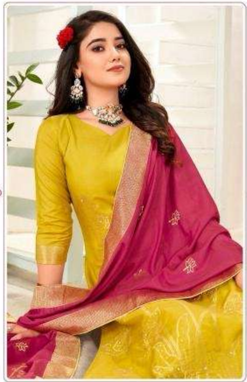
Embrace yourself with a glamorous look with this amazing ethnic collection.