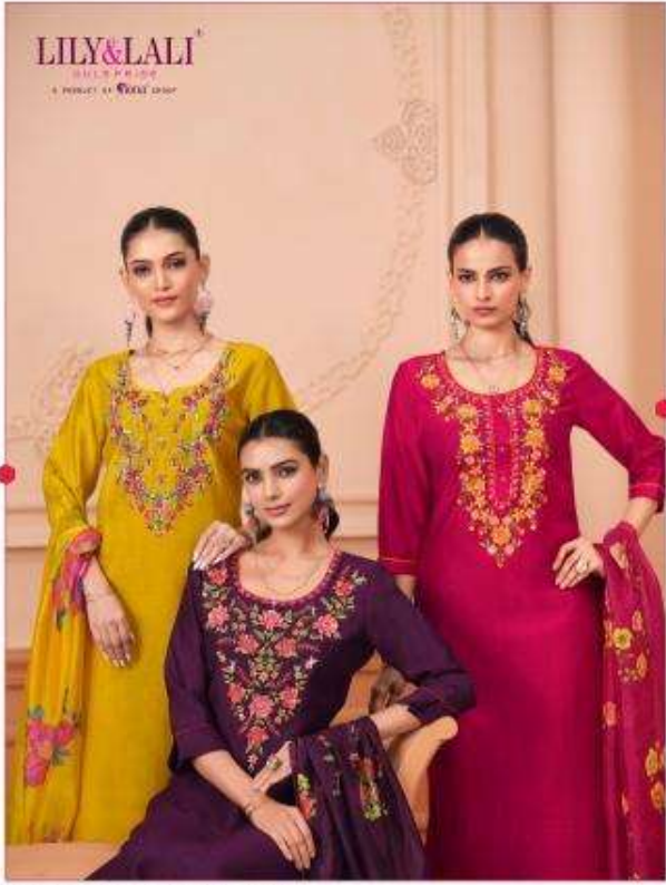
"Elegance is not standing out, but being remembered."