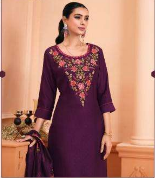
"Elegance is not standing out, but being remembered." 25301

LILY&LALI GOLD PRICE A PRODUCT OF BIKETI