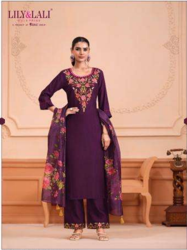
"Elegance is not standing out, but being remembered."