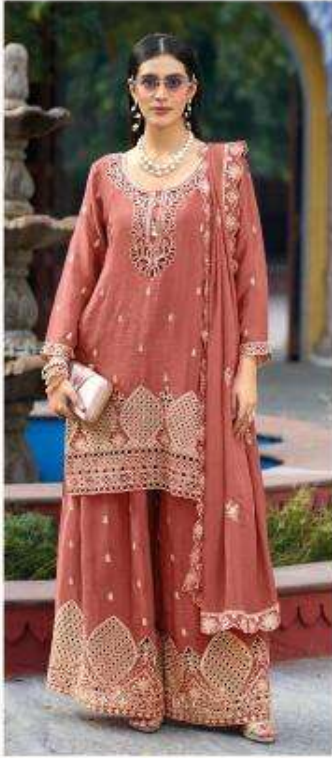
12011 - A