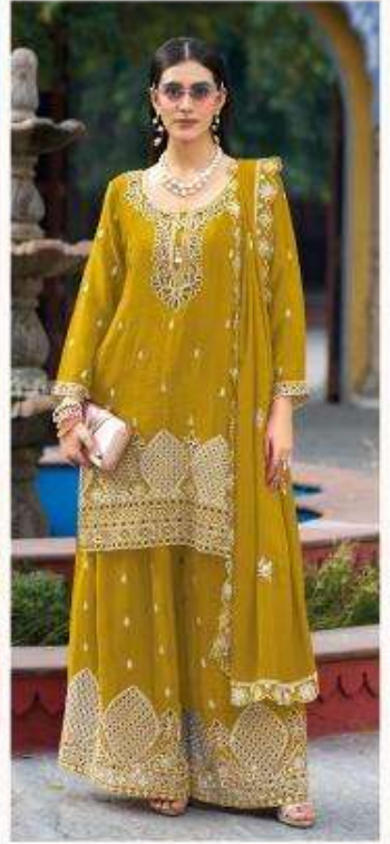
12011 - D