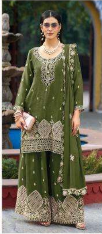
12011 - C