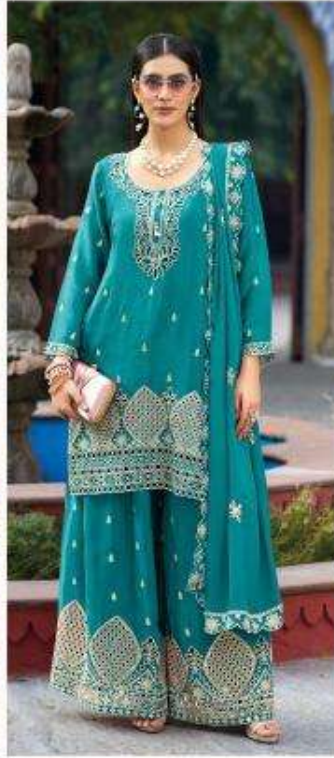
12011 - B