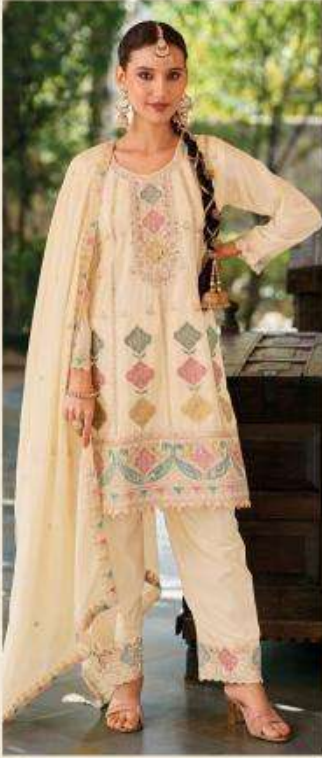
10081 - A