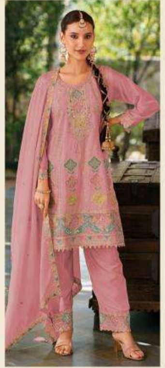
10081 - D