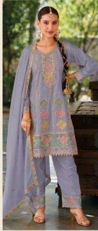
10081 - C