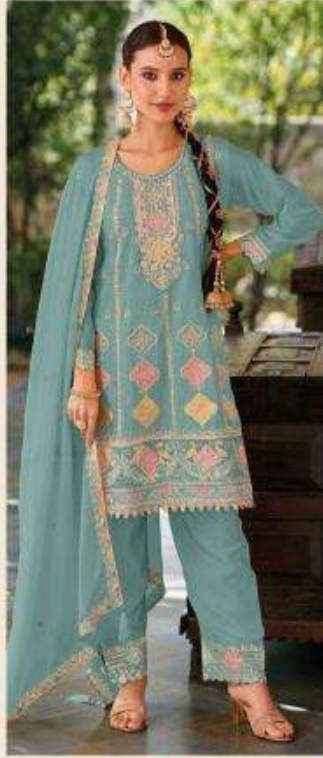
10081 - B