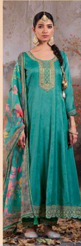
CODE | 5833