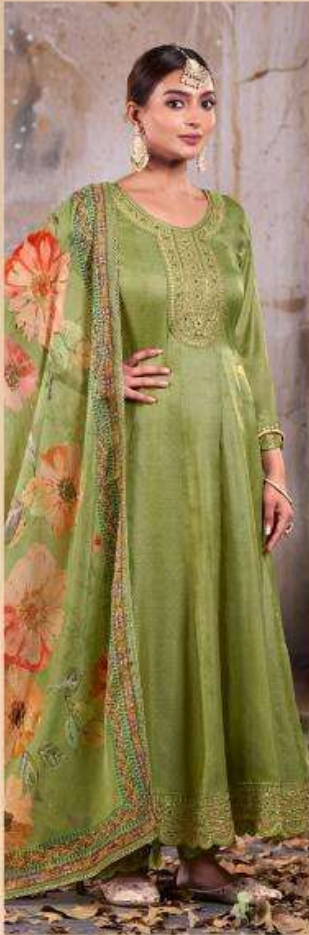
CODE | 5831