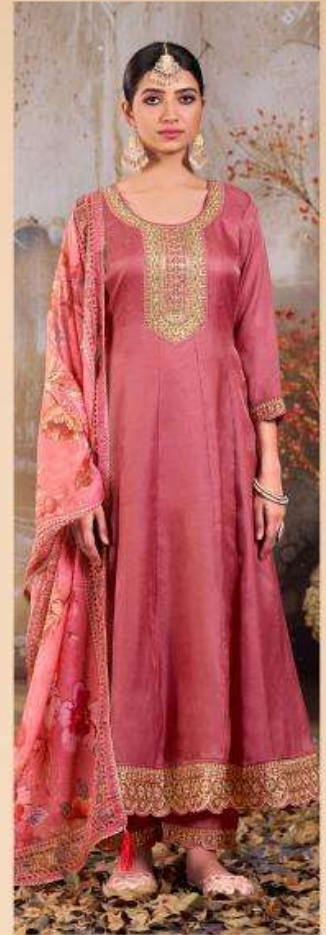
CODE | 5834