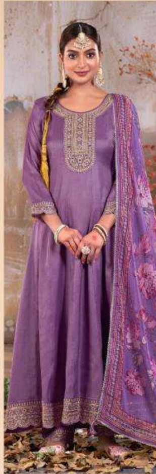
CODE | 5832