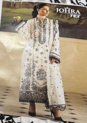
JT D.NO.158 A TOP:-REYON COTTON HEAVY EMBROIDERED WITH (PERALS MOTI WORK) DUPATTA:-KOTA CHECKS HEAVY EMBROIDERED BOTTOM:-REYON COTTON