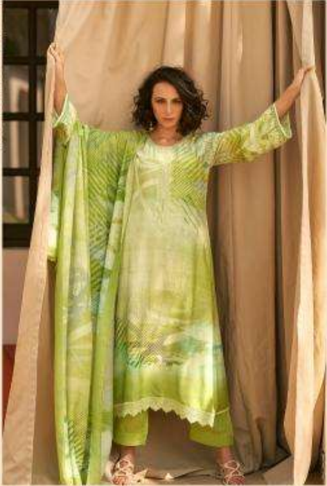
POWERFUL IS BEAUTIFUL. Fashion is the most powerful art. Its reinvention, design and architecture of its own, is always far more futuristic and what you'd like to be.