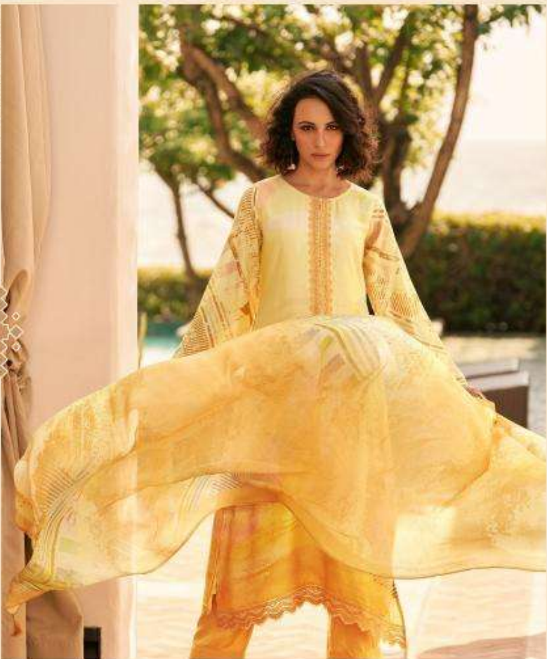
© Sadhana 2014. All rights reserved. For more information, visit www.sadhana.com

For this season, our work is inspired personal style of women. The hope is that the clothes we offer will transcend seasons because the language is timeless. The changes are minimal and easy. As our clothes are a result of natural fibers of creative designers, you will find a fresh story with each outfit and that is what makes the collection unique.