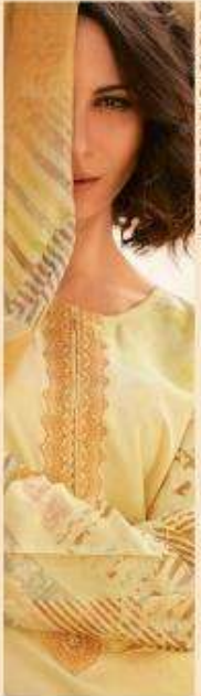
© Sadhana 2014. All rights reserved. For more information, visit www.sadhana.com