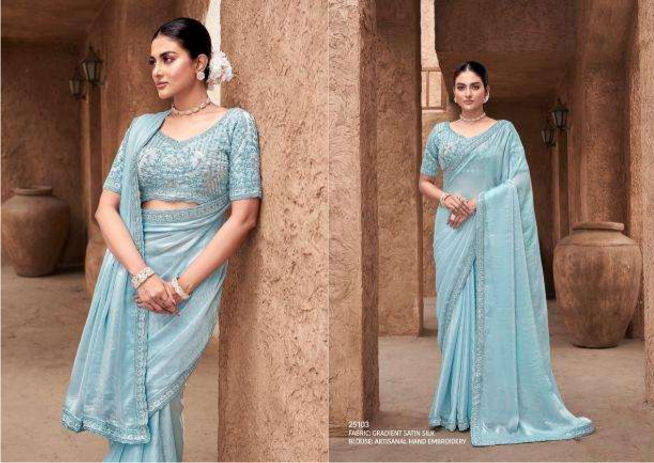
25103 FABRIC: GRADIENT SATIN SILK BLOOSE: ARTISANAL HAND EMBROIDERY