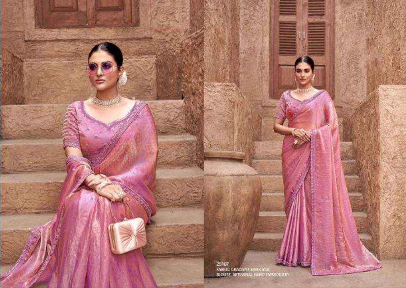
25107 FABRIC: GRADIENT SATIN SILK BLOUSE: ARTISANAL HAND EMBROIDERY