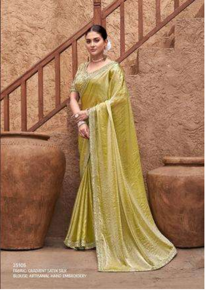
26106 FABRIC: GRADIENT SATIN SILK BLOUSE: ARTISANAL HAND EMBROIDERY