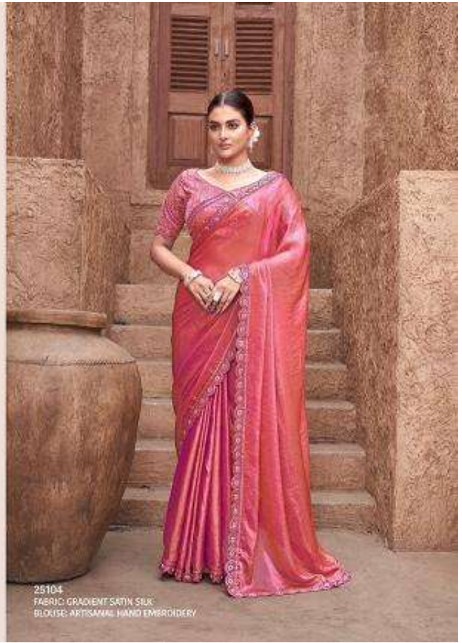
25104 FABRIC: GRADIENT SATIN SILK BLOUSE: ARTISANAL HAND EMBROIDERY