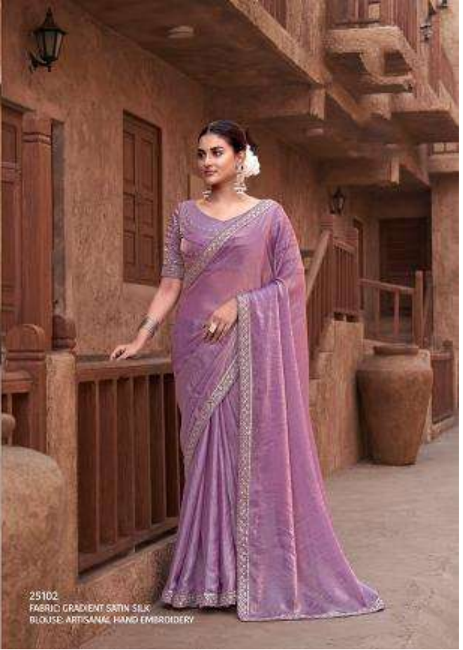
25102 FABRIC: GRADIENT SATIN SILK BLOUSE: ARTISANAL HAND EMBROIDERY