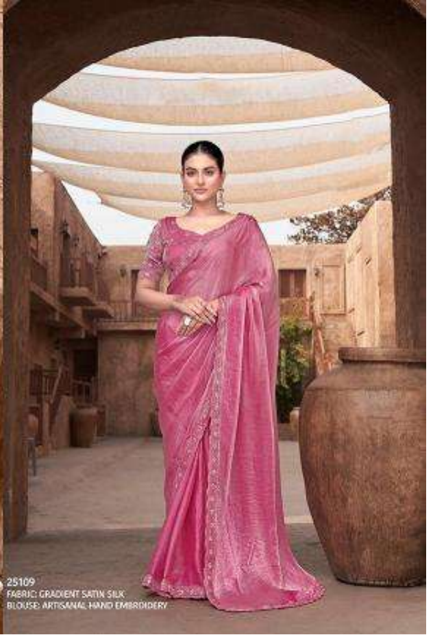
25109 FABRIC: GRADIENT SATIN SILK BLOUSE: ARTISANAL HAND EMBROIDERY