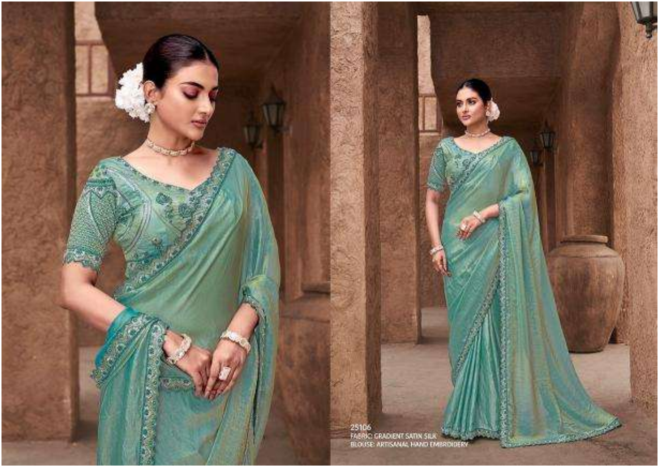
25106 FABRIC: GRADIENT SATIN SILK BLOUSE: ARTISANAL HAND EMBROIDERY