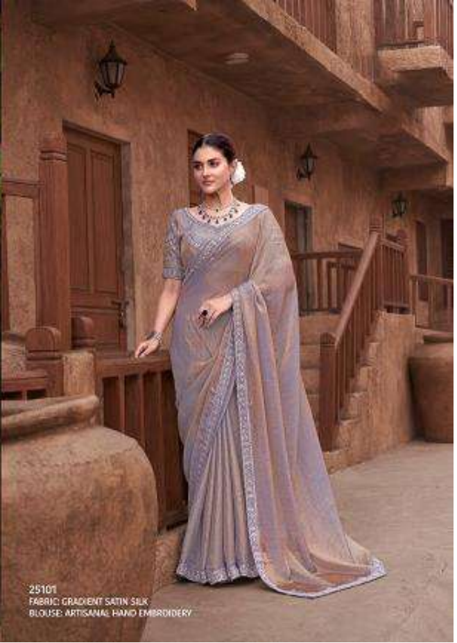
25101 FABRIC: GRADIENT SATIN SILK BLOUSE: ARTISANAL HAND EMBROIDERY