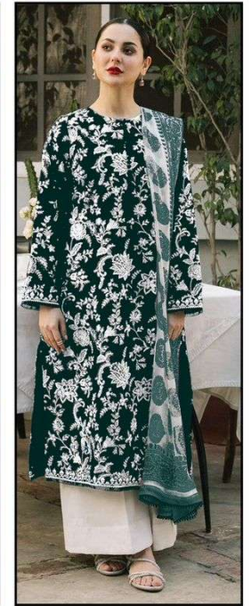
JT D.NO.157 I

TOP:- REYON COTTON HEAVY FRONT AND BACK BOTH SIDE EMBROIDERED