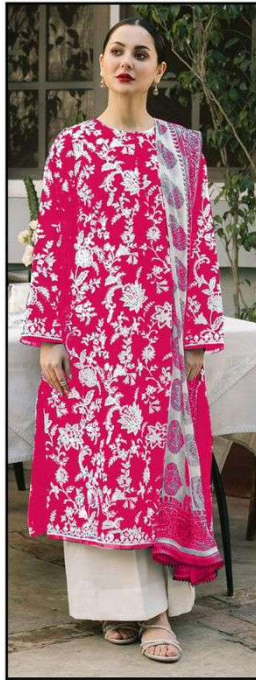
JT D.NO.157 F