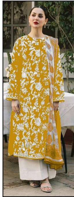
JT D.NO.157 G