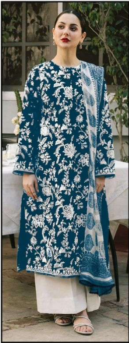
JT D.NO.157 E