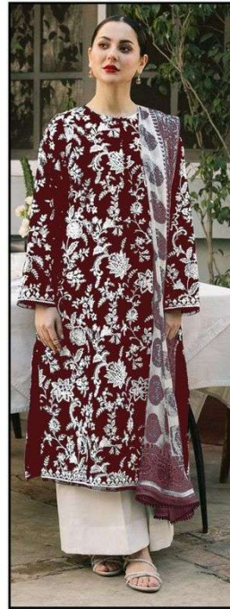
JT D.NO.157 H