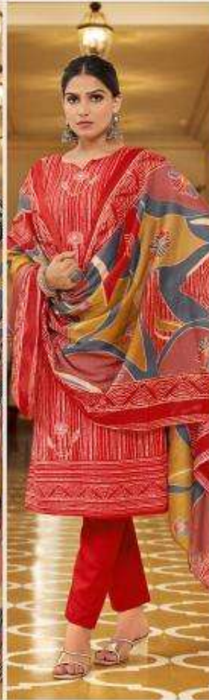
The New Design:3002