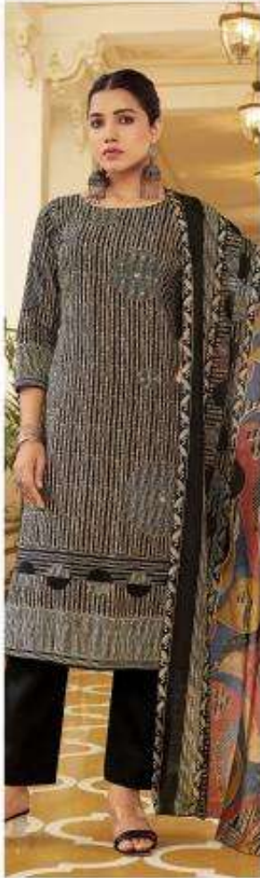
The New Design:3001