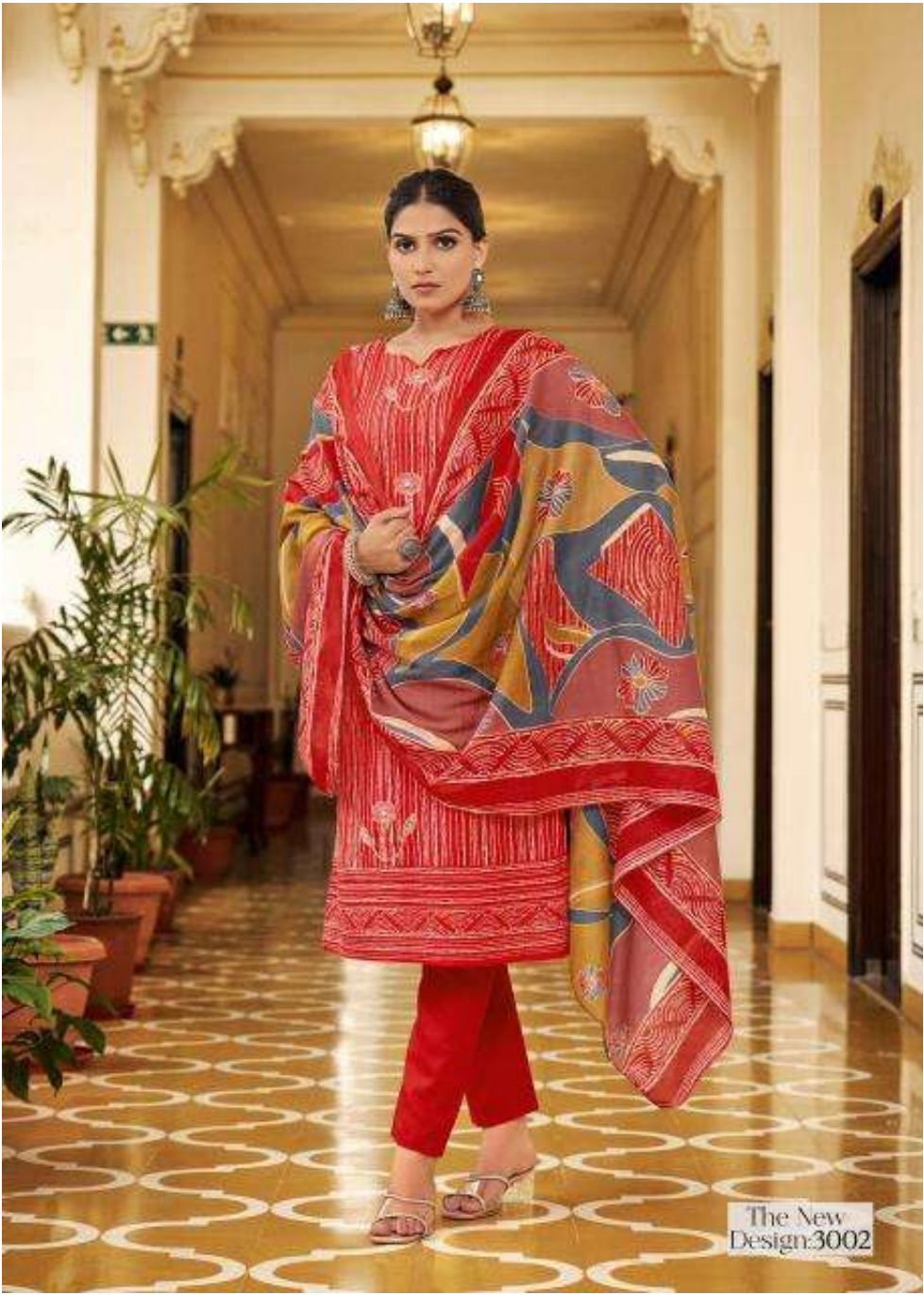
The New Design:3002