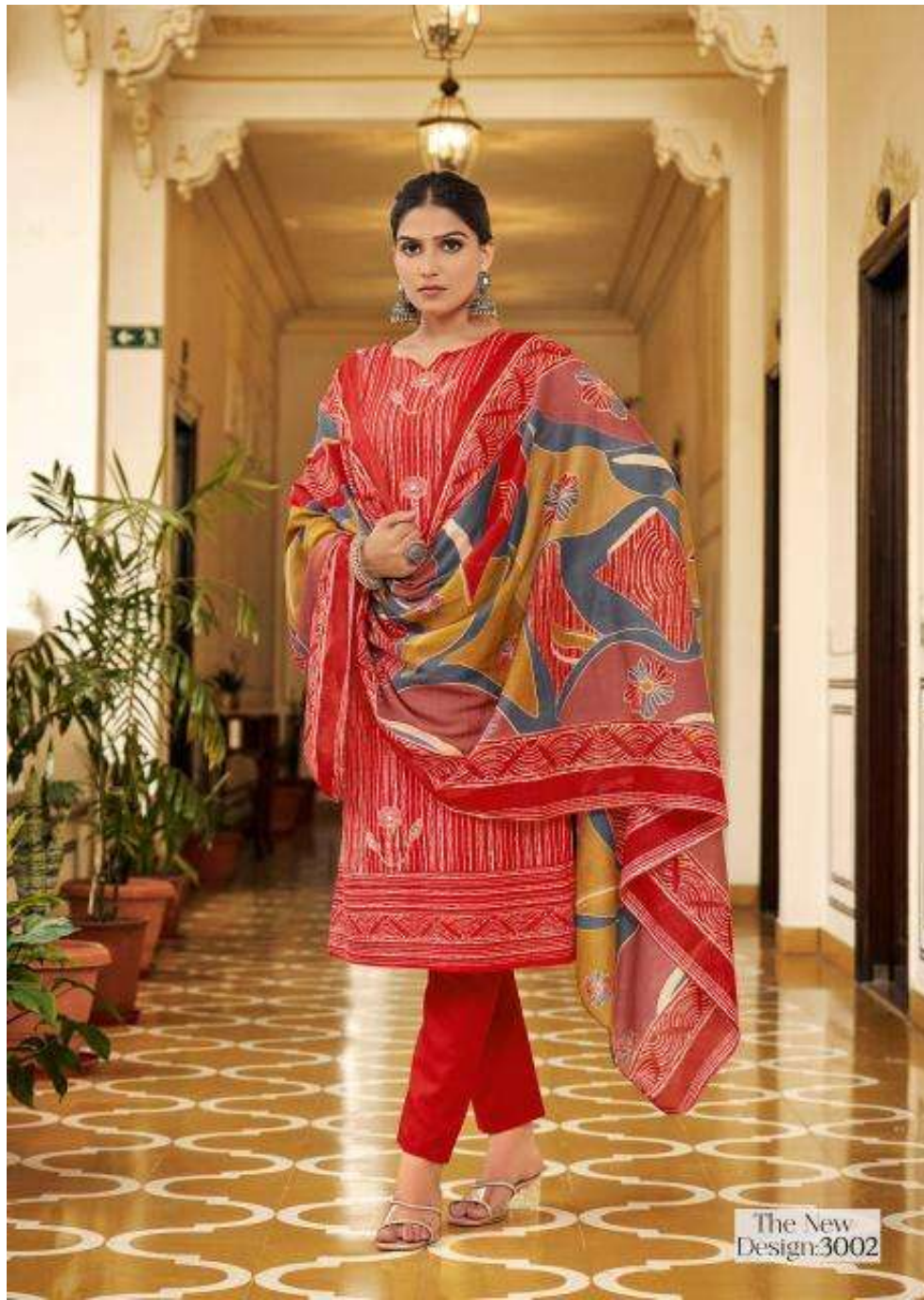
The New Design:3002