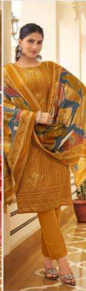
The New Design:3003