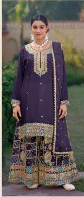
11021 - B