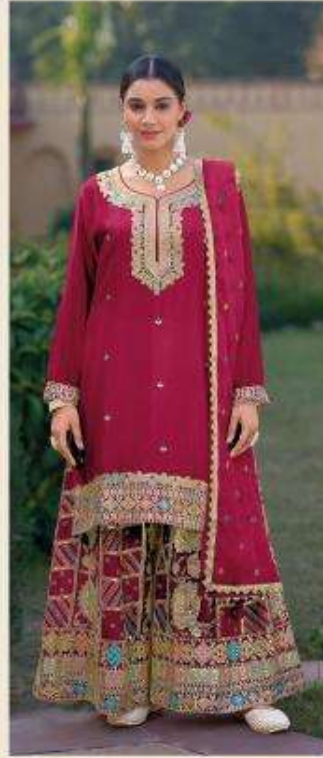
11021 - C