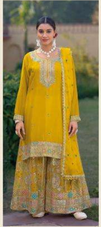
11021 - D