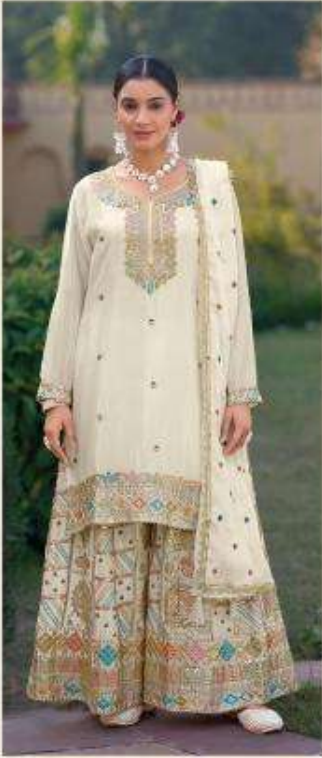
11021 - A