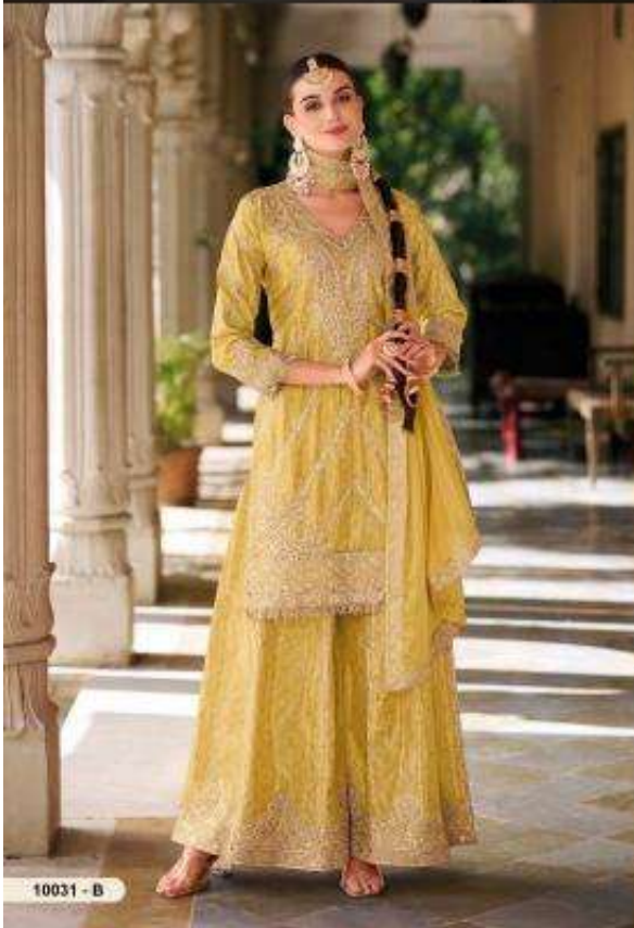
10031 - B