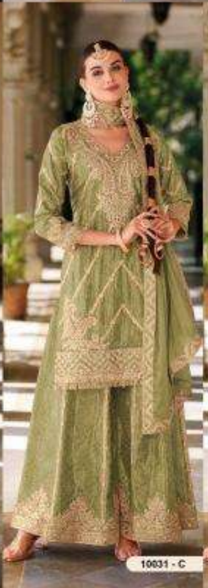
10031 - C