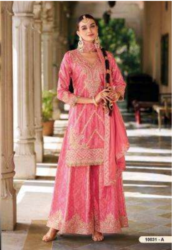
10031 - A