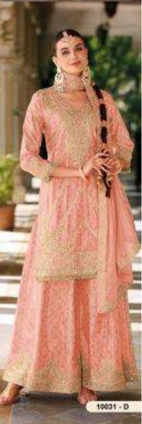
10031 - D