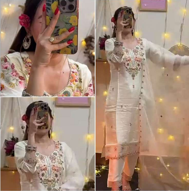
TOP- PURE FOX GEORGETTE WITH HEAVY EMBROIDERY AND SEQUENCE WORK WITH MOTI WORK BOTTOM/NEER- DULL SHANTOON DUPATTA- PURE ORGANZA FANCY DUPATTA WITH HEAVY EMBROIDERY WITH MOTI WORK