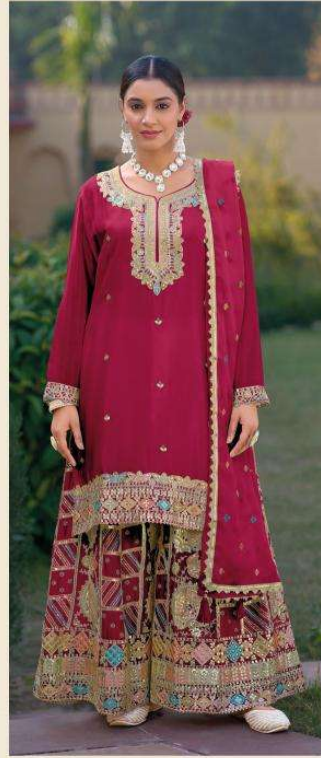
11021 - C