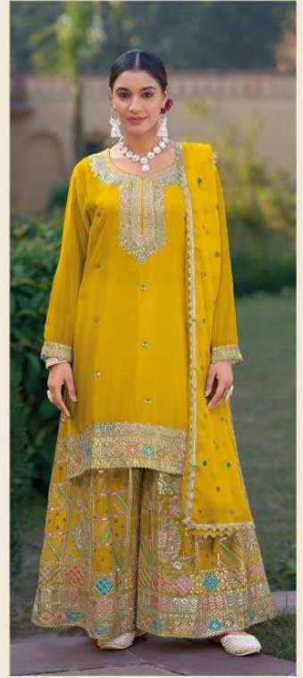
11021 - D