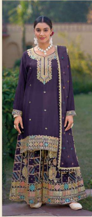
11021 - B