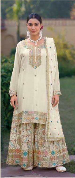
11021 - A