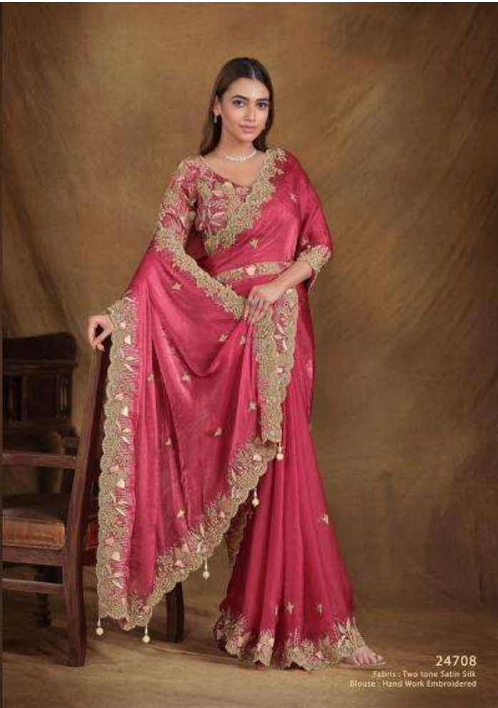
24708 Fabric: Two-tone Satin Silk Blouse: Hand Work Embroidered