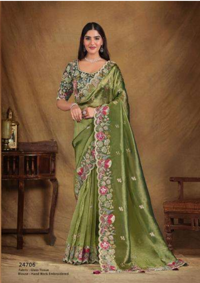
24706 Fabric : Glass Tissue Blouse : Hand Work Embroidered