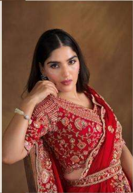
24710 Fabric : Two tone Satin Silk Blouse : Hand Work Embroidered