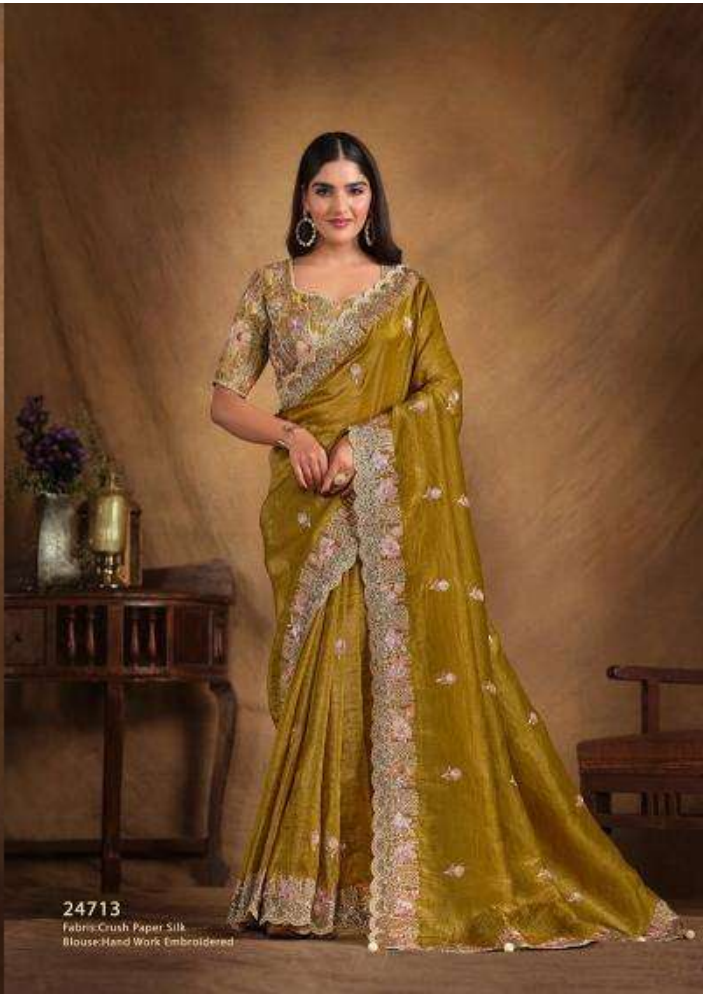
24713 Fabric: Crush Paper Silk Blouse: Hand Work Embroidered