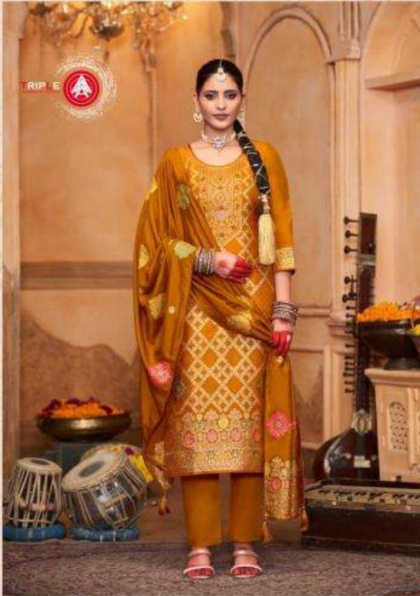
Culture is just another accessory for someone with great style...