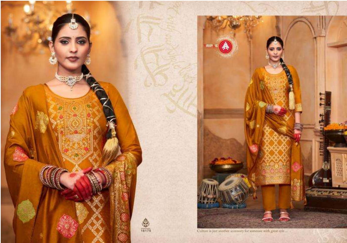
Culture is just another accessory for someone with great style...