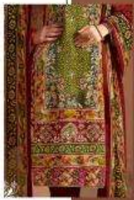
Product name of the body piece and the shawl are mentioned in the description below. Please refer to the product page for more details.