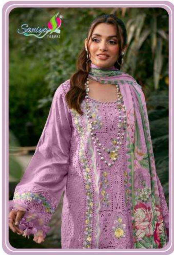
ADAN LIBAS CHIKANKARI - 29