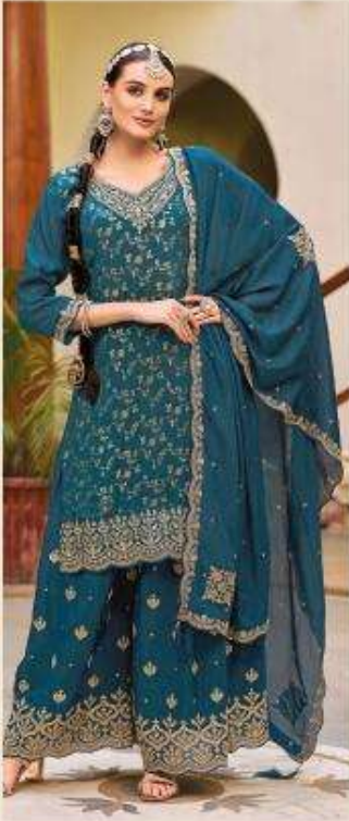
10051 - A