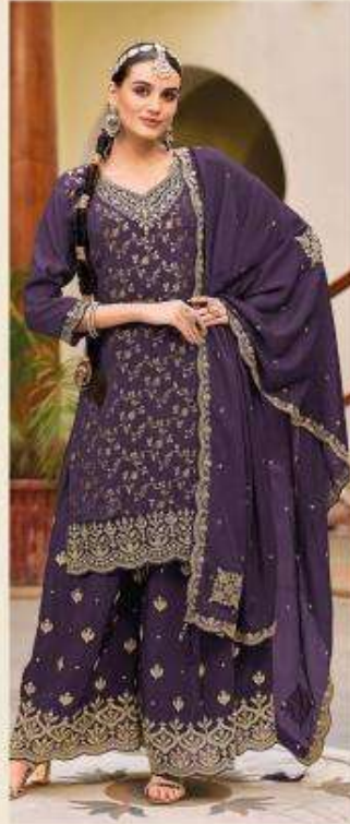
10051 - C