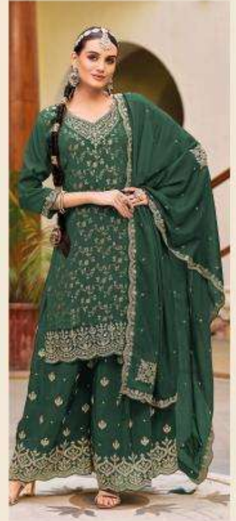
10051 - D