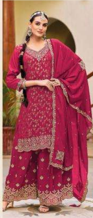
10051 - B