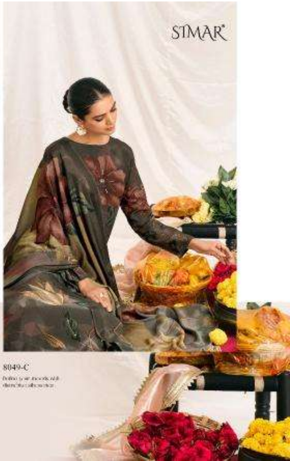
8049-C Dünya'nın en güzel kadın koleksiyonlarından.