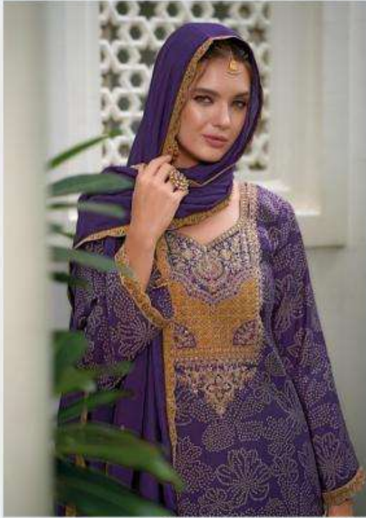
Fashion is the power to sustain the reality of everyday life -----