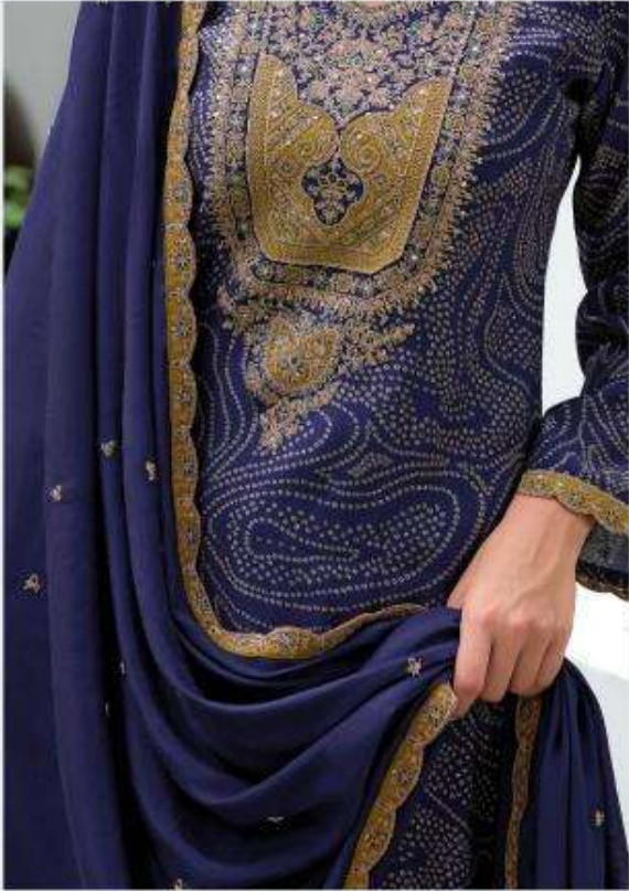
..... The difference between style and fashion is quality