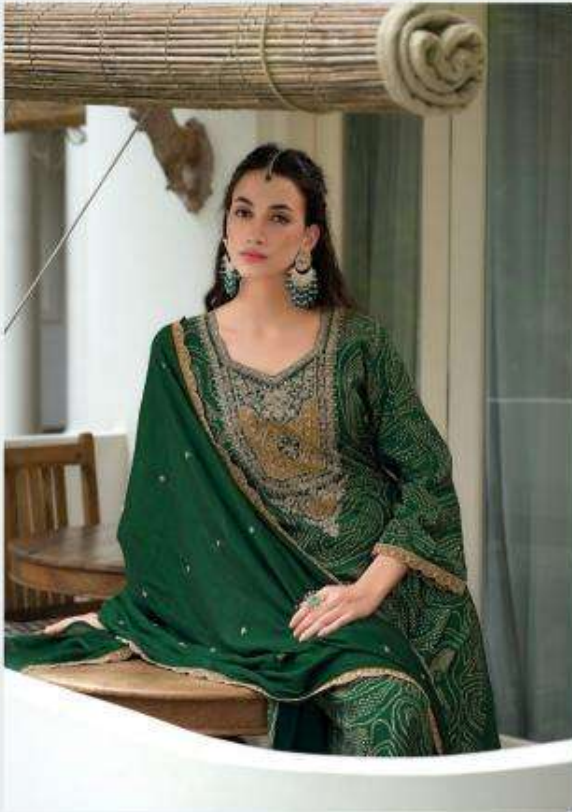
----- In order to be successful, one must always be different — 1127