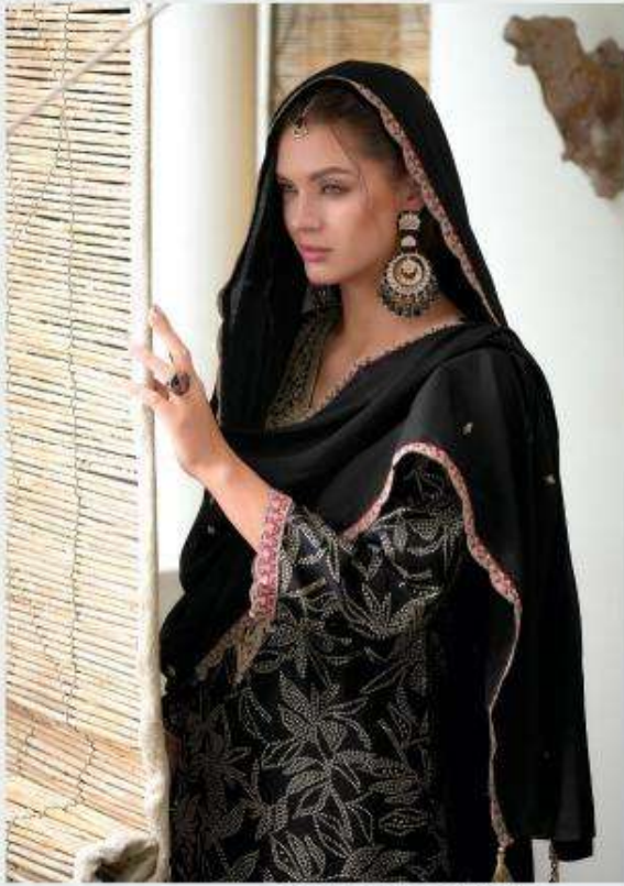
Style is a way to say who you are without having to speak