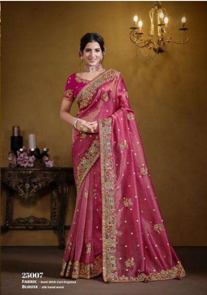
25007 FABRIC : Isted With Zari Orpenna BLOUSE : silk hand work