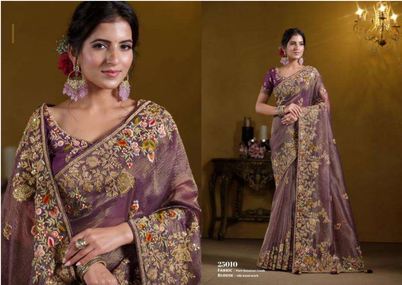
25010 FABRIC : Pure Banarasi Crutch BLOUSE : silk hand work