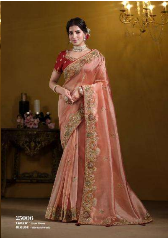
25006 FABRIC : Glass Tissue BLOUSE : silk hand work