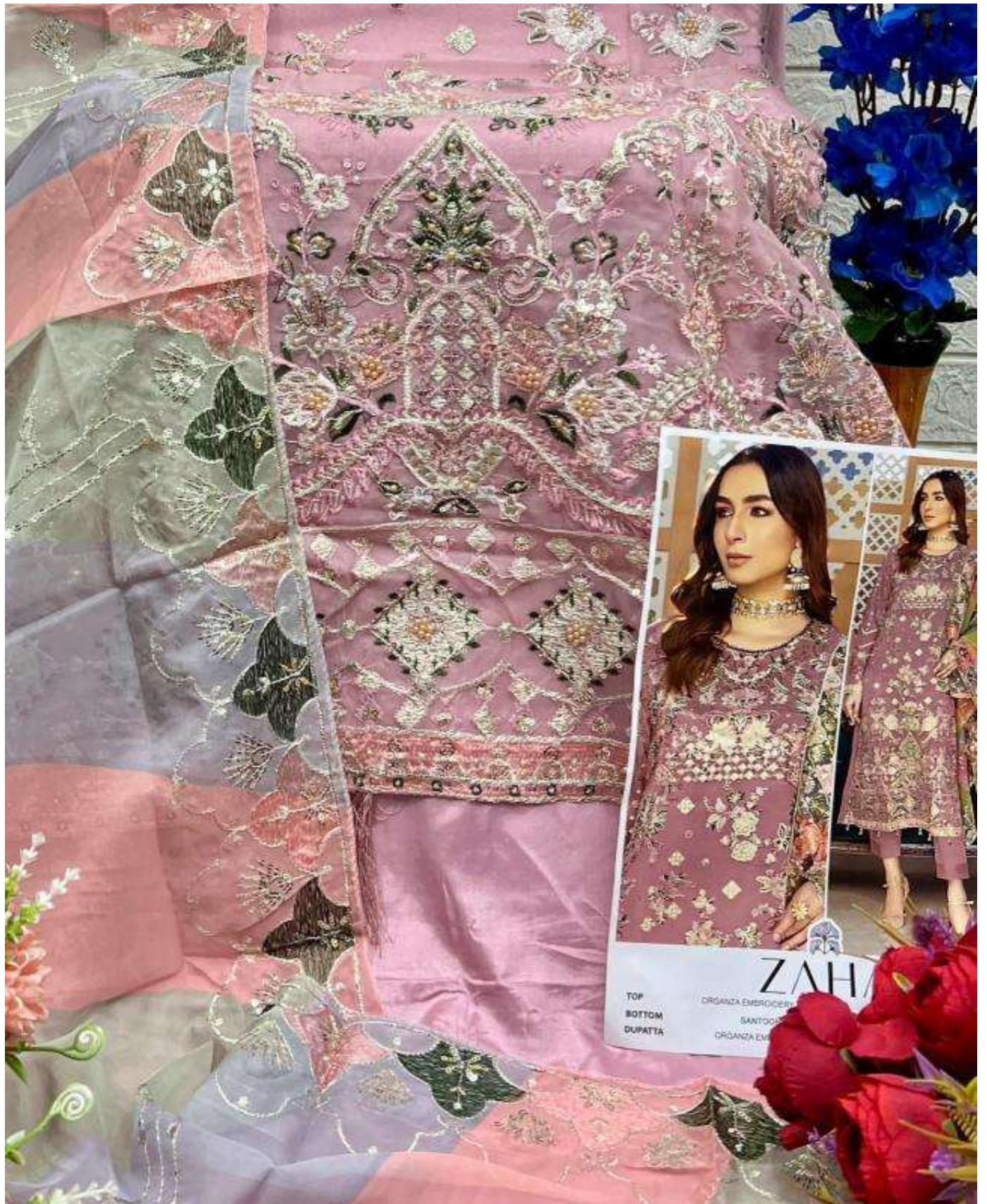
ZAHN TOP ORGANZA EMBROIDERY BOTTOM SANTOCCI DUPATTA ORGANZA EMBROIDERY