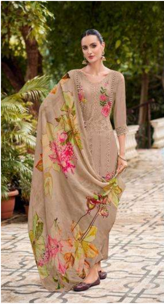
THE ART OF BEING GRACEFUL