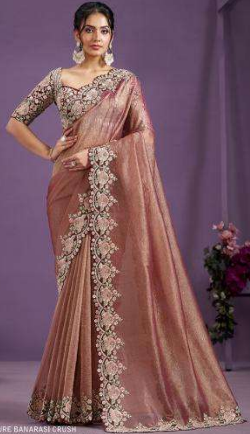
24806 FABRIC : PURE BANARASI CRUSH BLOUSE : HAND WORK EMBROIDERED