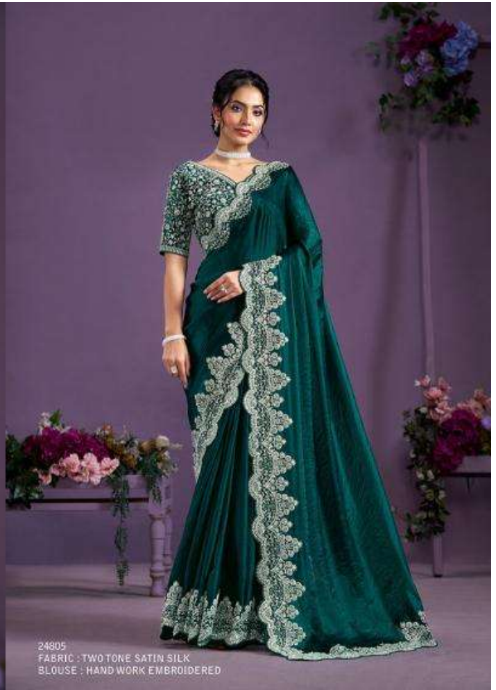
24805 FABRIC : TWO TONE SATIN SILK BLOUSE : HAND WORK EMBROIDERED