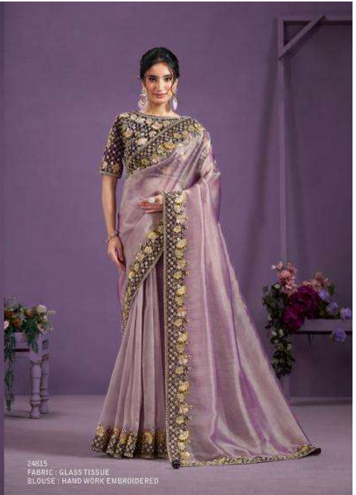
24815 FABRIC : GLASS TISSUE BLOUSE : HAND WORK EMBROIDERED