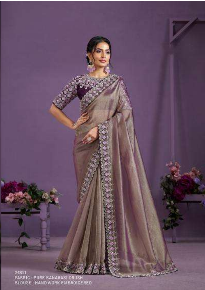
24811 FABRIC : PURE BANARASI CRUSH BLOUSE : HAND WORK EMBROIDERED