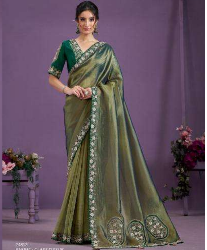
24812 FABRIC : GLASS TISSUE BLOUSE : HAND WORK EMBROIDERED