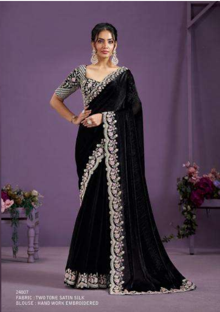
24807 FABRIC : TWO TONE SATIN SILK BLOUSE : HAND WORK EMBROIDERED