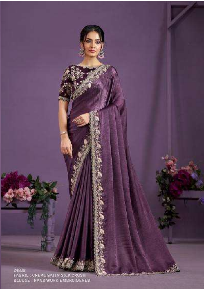
24808 FABRIC : CREPE SATIN SILK CRUSH BLOUSE : HAND WORK EMBROIDERED