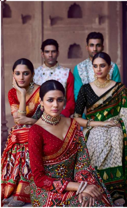
R III ■ the sophisticated philosophy