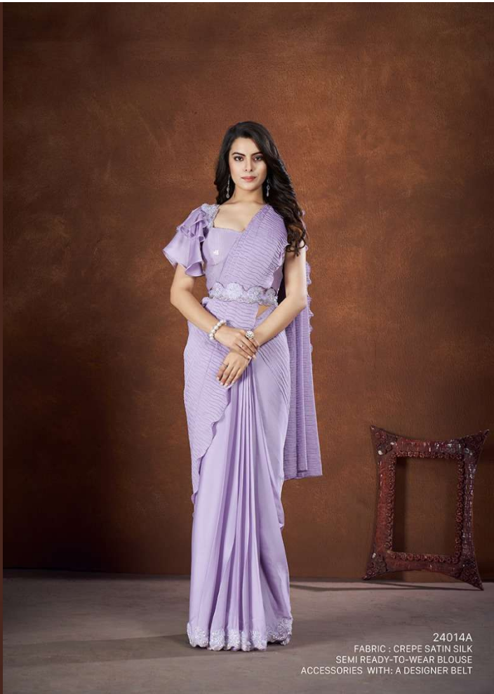
24014A FABRIC : CREPE SATIN SILK SEMI READY-TO-WEAR BLOUSE ACCESSORIES WITH: A DESIGNER BELT