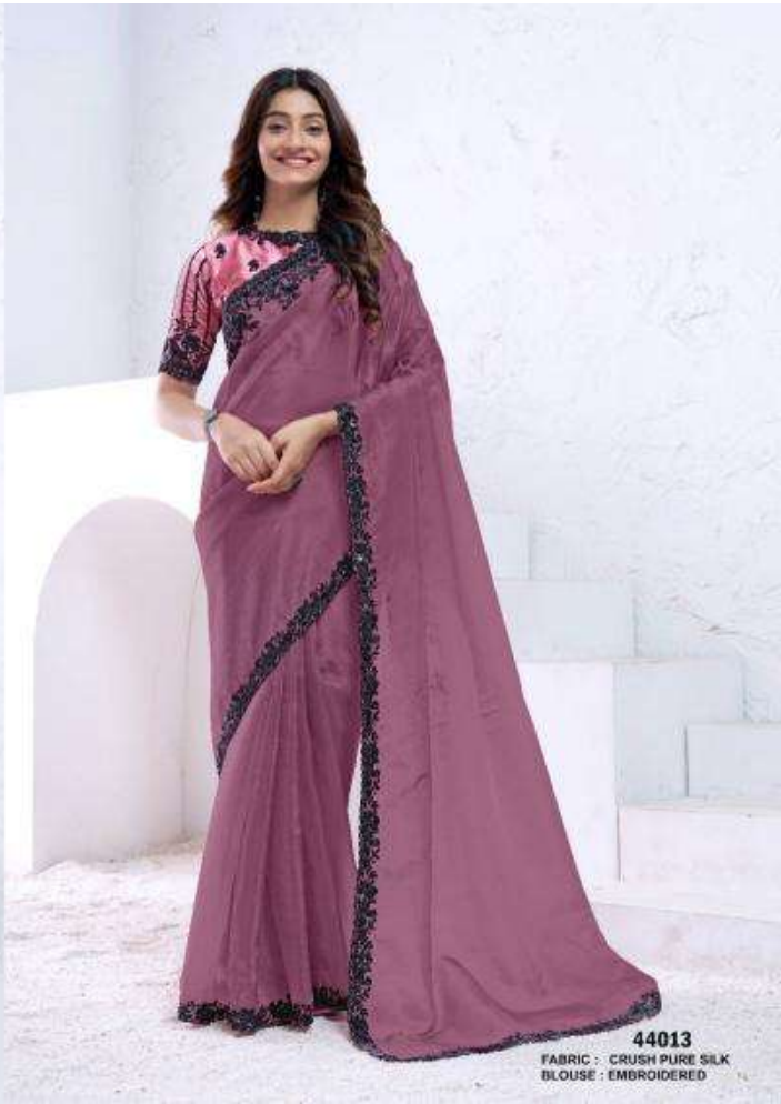
44013 FABRIC : CRUSH PURE SILK BLOUSE : EMBROIDERED