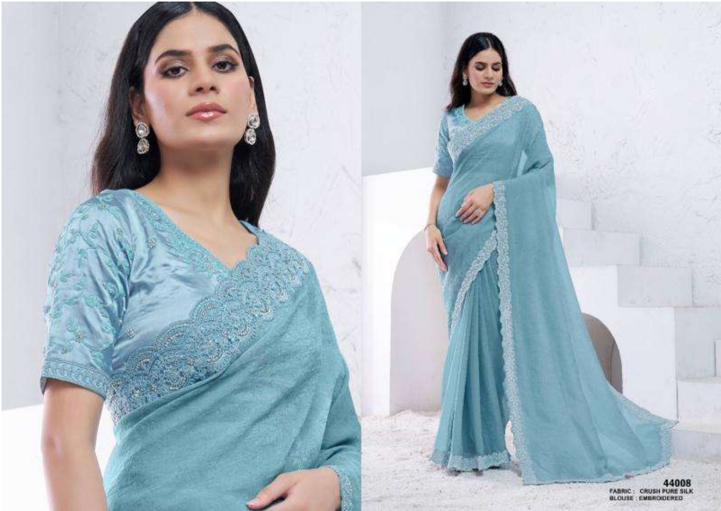
44008 FABRIC : CRUSH PURE SILK BLOUSE : EMBROIDERED