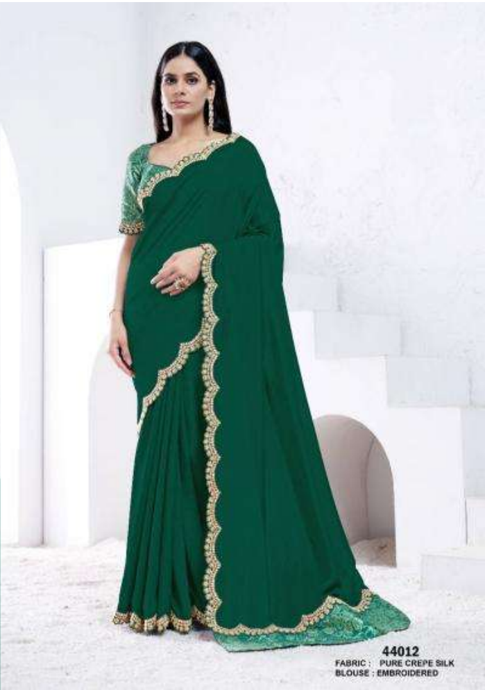
44012 FABRIC : PURE CREPE SILK BLOUSE : EMBROIDERED