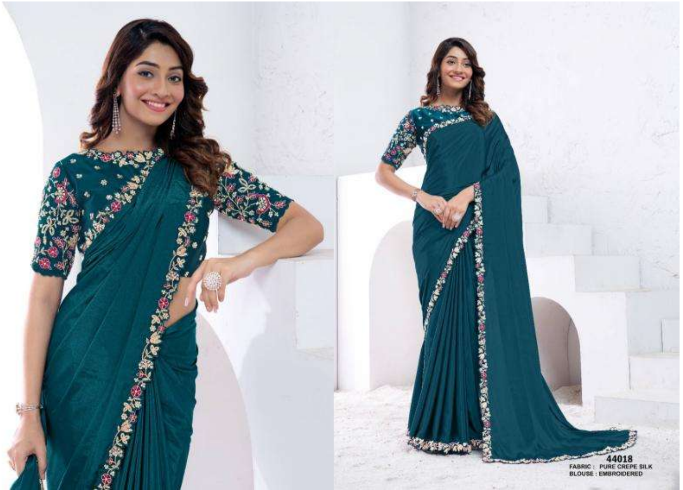
44018 FABRIC : PURE CREPE SILK BLOUSE : EMBROIDERED