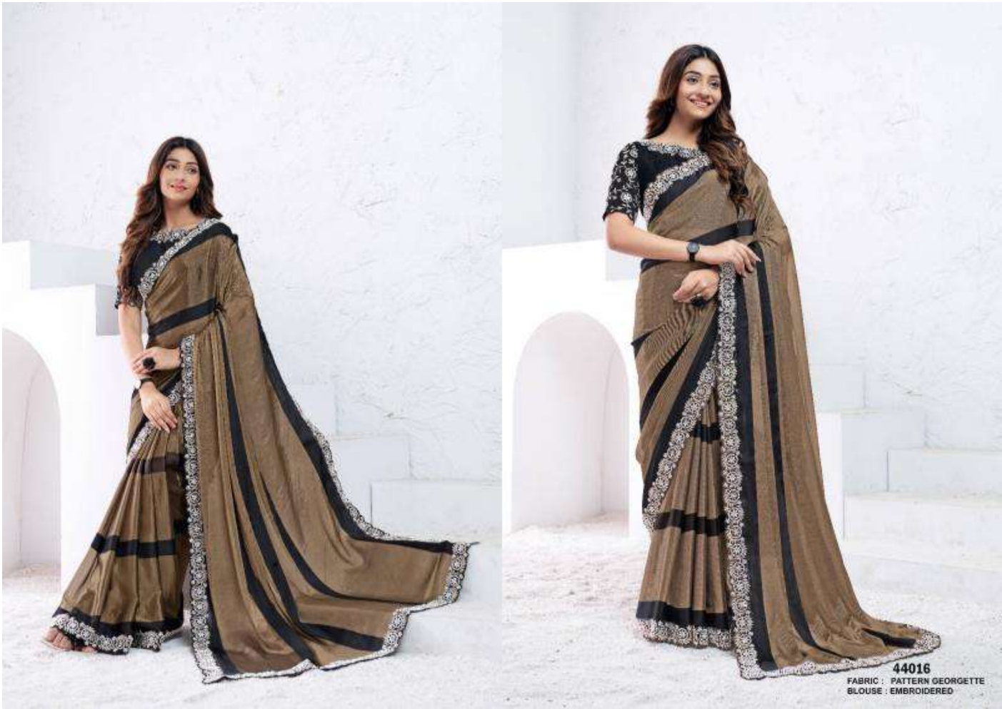
44016 FABRIC : PATTERN GEORGETTE BLOUSE : EMBROIDERED