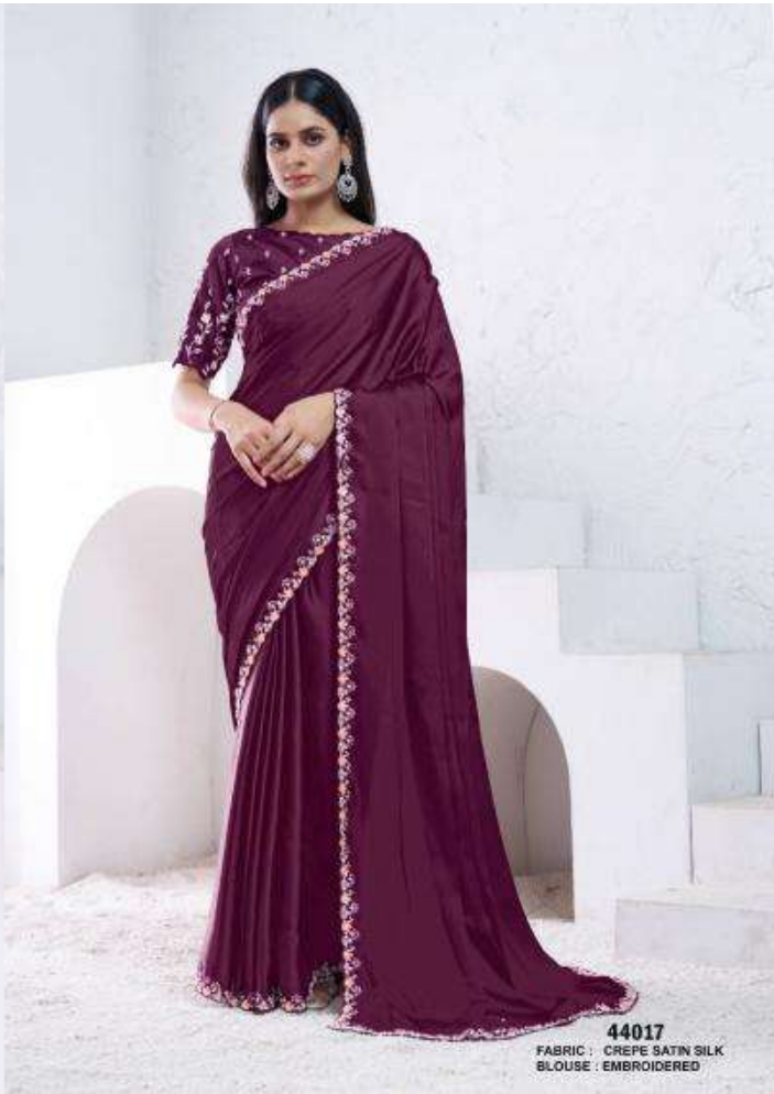
44017 FABRIC : CREPE SATIN SILK BLOUSE : EMBROIDERED