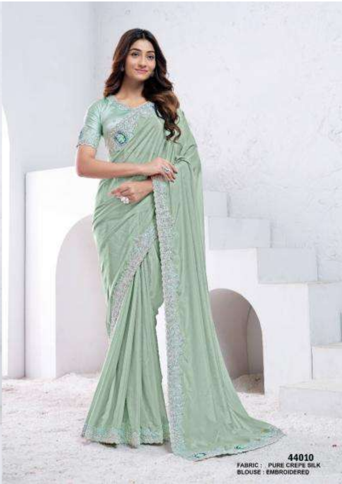
44010 FABRIC : PURE CREPE SILK BLOUSE : EMBROIDERED