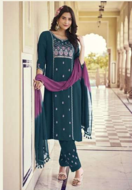
.... 904 ....