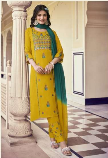
.... 903 ....