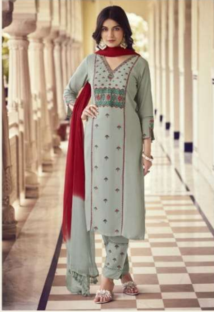
.... 901 ....