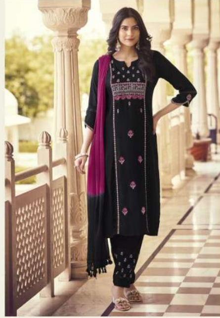
.... 902 ....