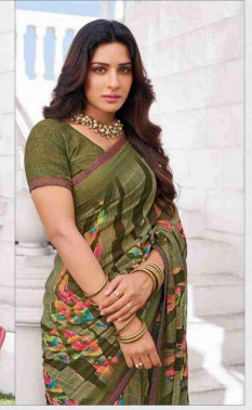
80810 (With stone work)