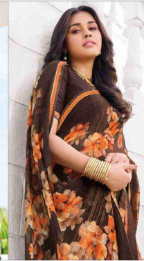
80812 (With stone work)