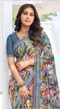
80811 (With stone work)