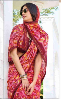
80813 (With stone work)