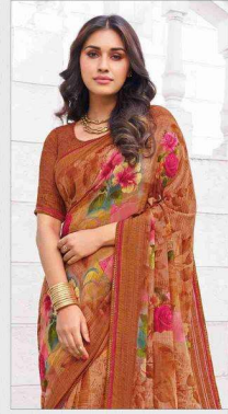
80808 (With stone work)