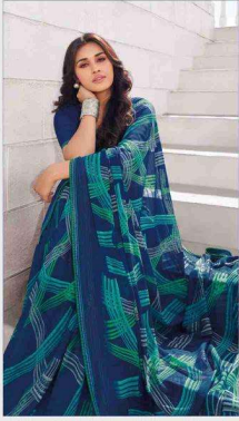
80802 (With stone work)