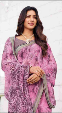
80807 (With stone work)