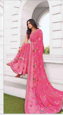
80809 (With stone work)