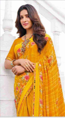
80804 (With stone work)