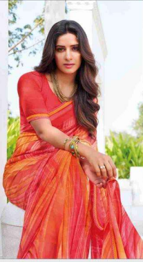
80803 (With stone work)