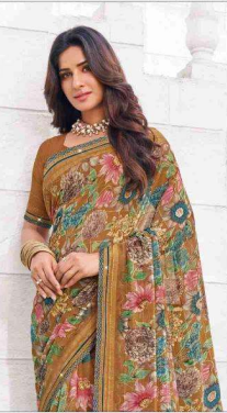
80806 (With stone work)