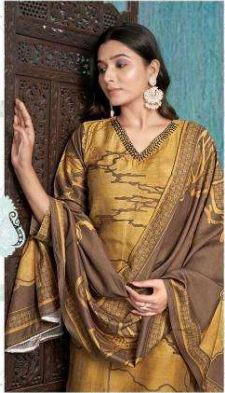
Indian Fashion Designer Sarees and Kurtis are all the season's favorite and elegant and easy to wear. Designer Saree, Saree Kurta and Kurtis are the latest trend in Indian fashion. When you add traditional saris to contemporary work in printing designs, they emerge as best wear examples for women for formal family gatherings or even for a wedding ceremony.