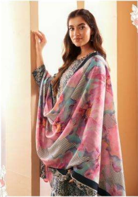
Glan face The Model is wearing size 36 SOHANA 3903