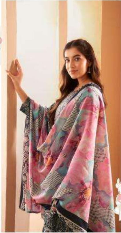
Glam fare The Best of both worlds and of course the most beautiful one. SUHANA 3903