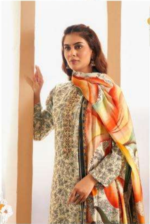
SIMPLICITY IN MODERNISM The traditional embroidery meets the modern fashion. SUHANA-3304