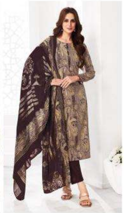
501 - C