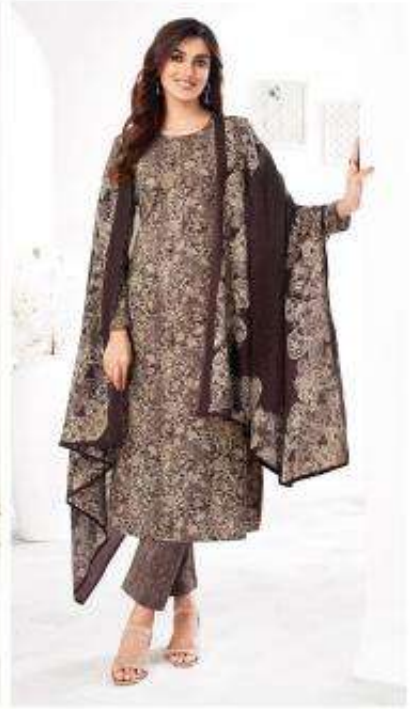
401 - C