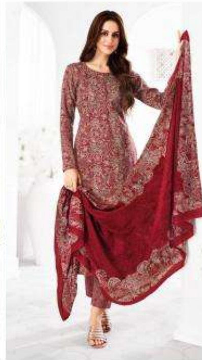
401 - E