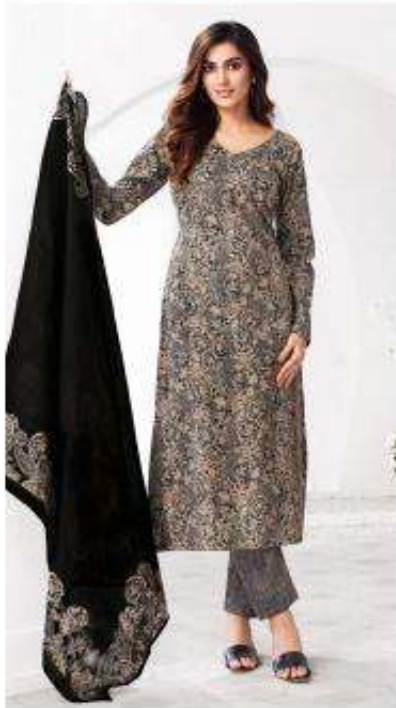
401 - D