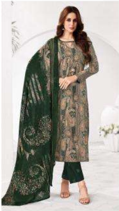
501 - A