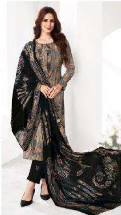
501 - D