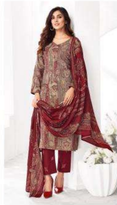
501 - E