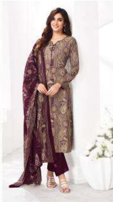
501 - B