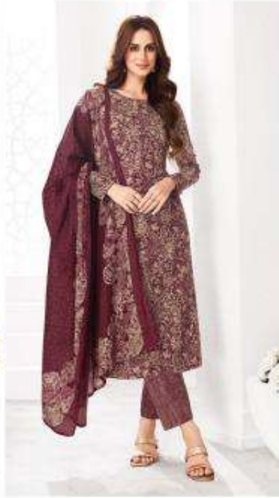
401 - B