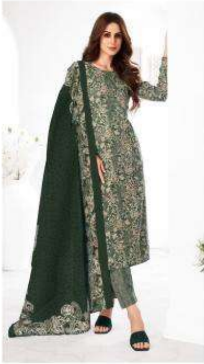
401 - A