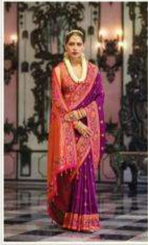
— KRESHVA —