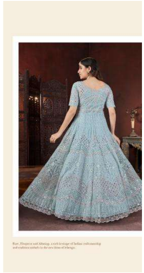
Bar, Elegance and Alluring, a rich heritage of Indian craftsmanship and modernity in the new form of Lehenga.