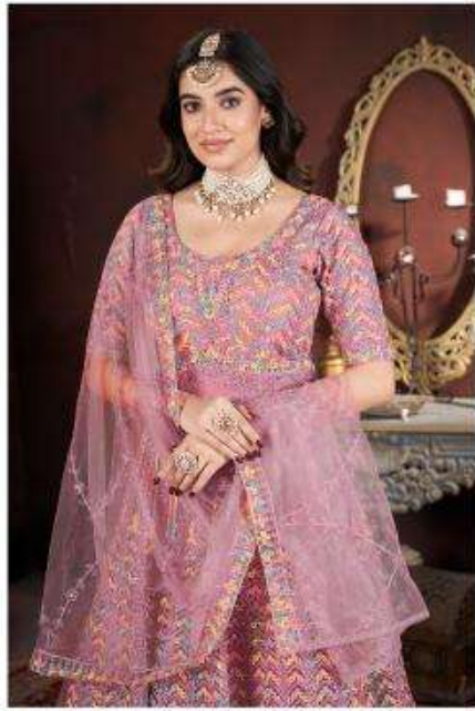
Best: Elegance and Mixing: a rich heritage of Indian craftsmanship and modern methods in the new form of designs.