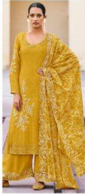
LOOK | 3042