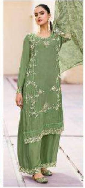
LOOK | 3044