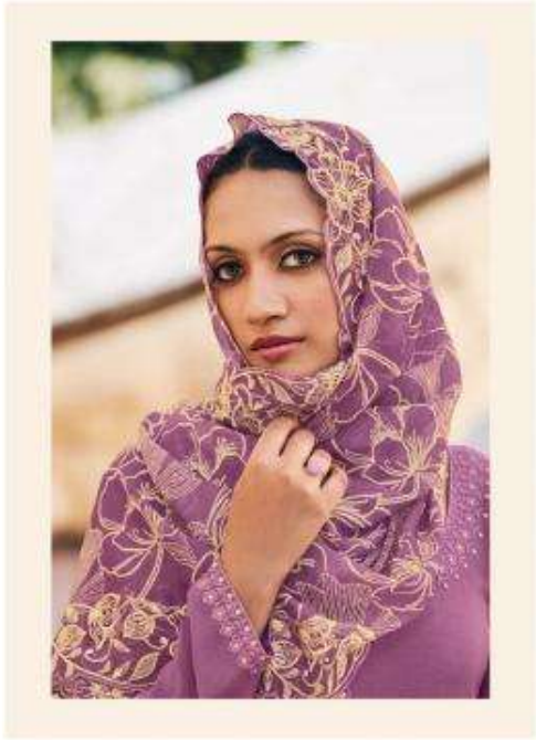
LOOK | 3041

© 2023 SHEHNAZ. ALL RIGHTS RESERVED. THE COLLECTION IS AVAILABLE ONLY ON SHEHNAZ.COM