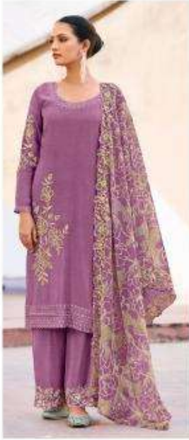
LOOK | 3041