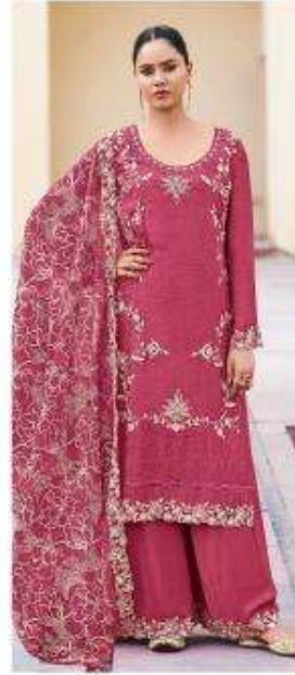
LOOK | 3043