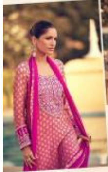
Single layered kurta, set of shawl & pantone with mirror fabric. D-NO : 574