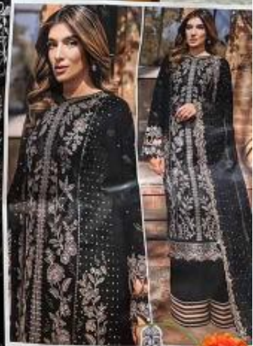
FARASHA VOL-1 TOP Embroidered Cotton Fabric