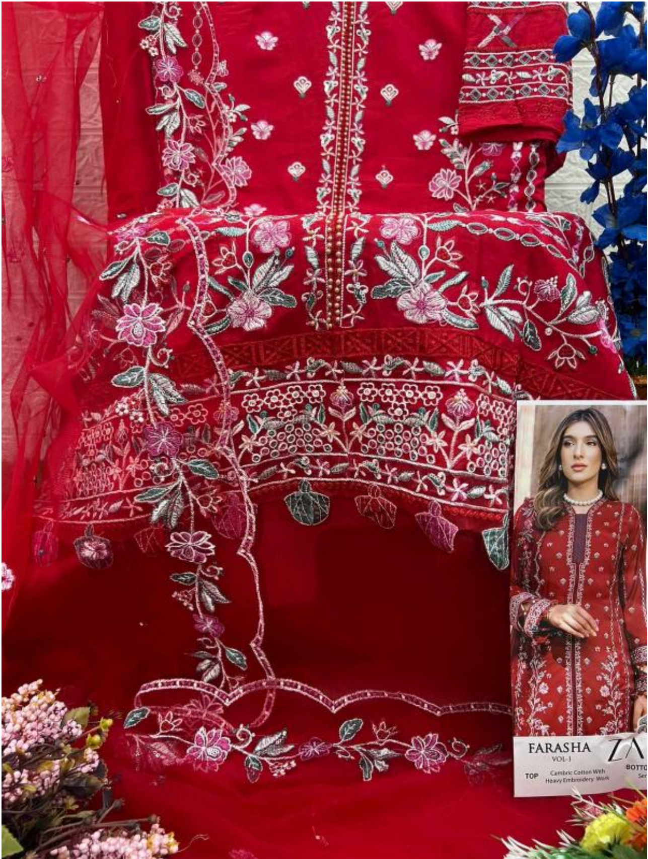
FARASHA VOL-1 TOP Cambric Cotton With Heavy Embroidery Work ZA BOTTOM Set