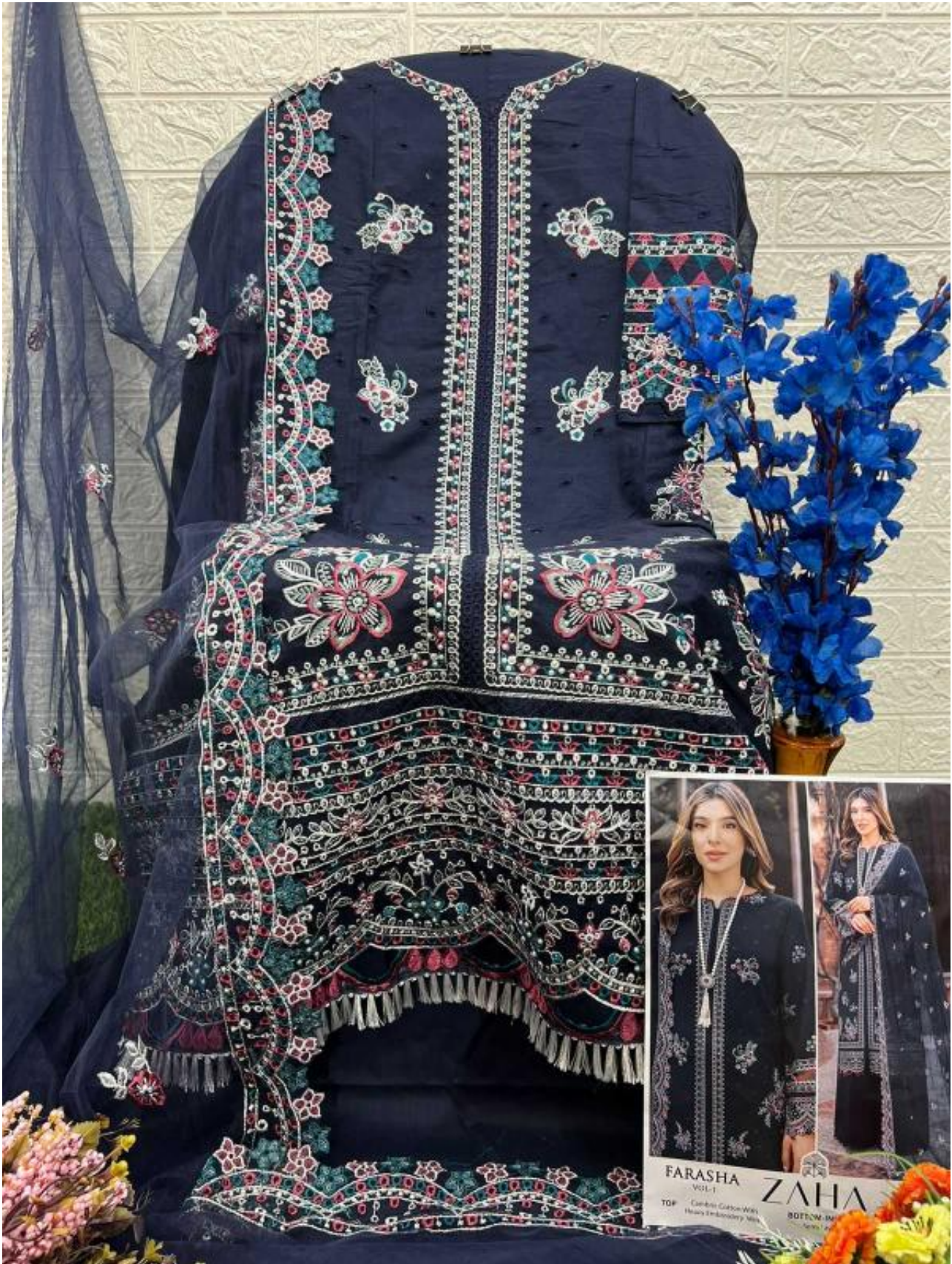
FARASHA VOL-1 TOP - Combo Cotton With Heavy Embroidery Mix ZAHA BOTTOM - Mix Cotton With Heavy Embroidery Mix