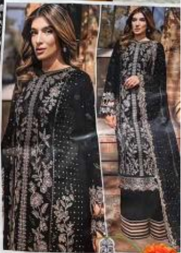
FARASHA VOL-1 ZAHARA TOP Embroidered Cotton Fabric