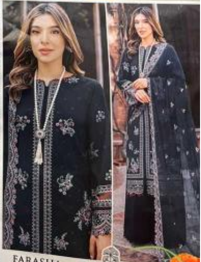
FARASHA VOL-1 TOP Cotton Cotton With Heavy Embroidery Mix ZAHA BOTTOM Cotton Cotton With Heavy Embroidery Mix