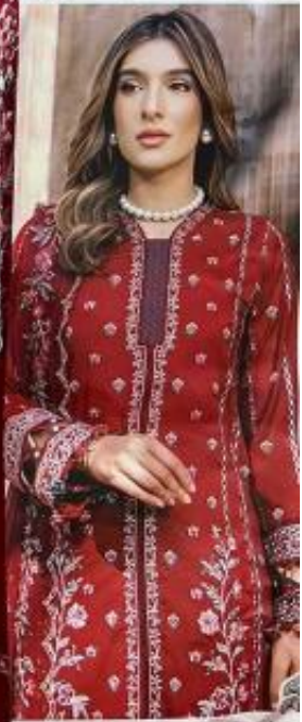
FARASHA VOL-1 TOP Cambric Cotton With Heavy Embroidery Work ZA BOTTO Ser