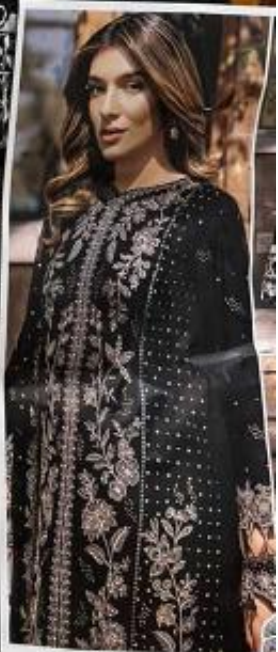
FARASHA VOL-1 Z TOP Carbalic Corssa With Heavy Embroidery Work 80