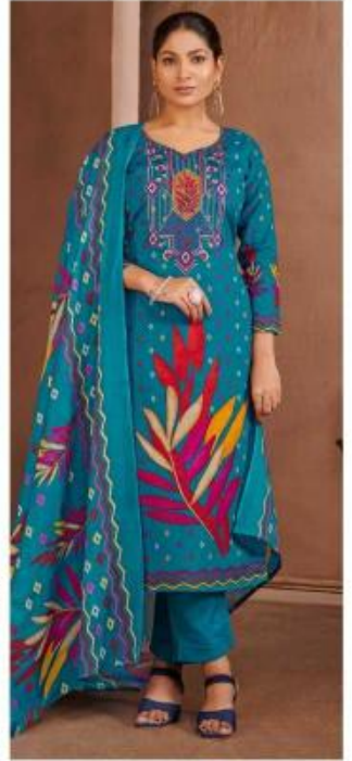
• 18004 •