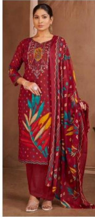
• 18003 •