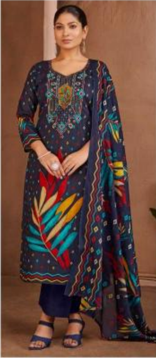
• 18001 •