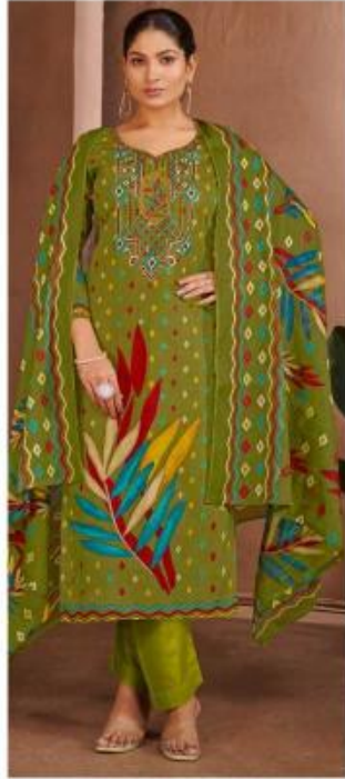
• 18002 •